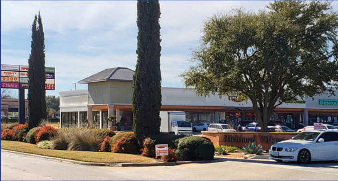
Belt Line Road and Plano Road in Richardson, Texas