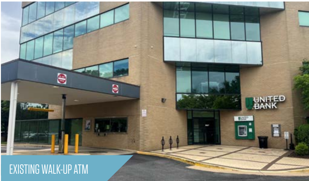
EXISTING WALK-UP ATM