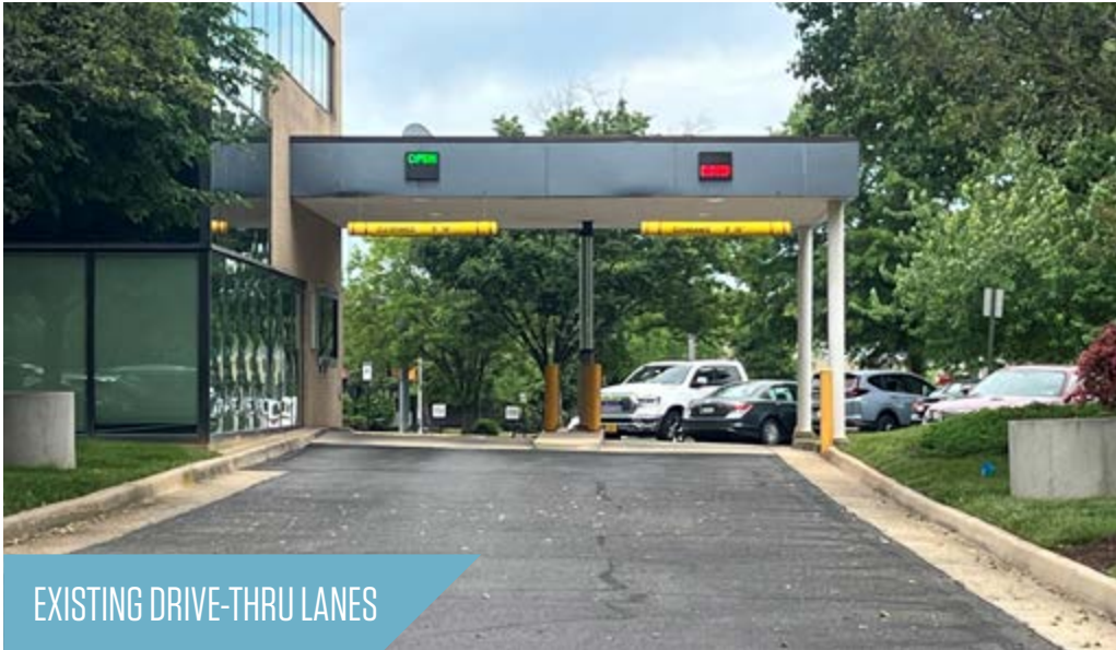
EXISTING DRIVE-THRU LANES