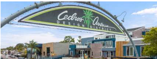
CEDROS DESIGN DISTRICT