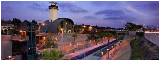
SOLANA BEACH TRAIN STATION