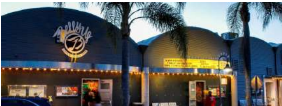
BELLY UP TAVERN