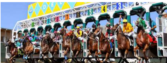
DEL MAR RACE TRACK