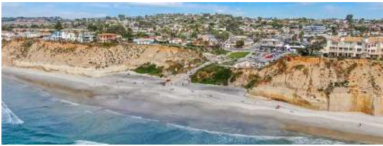
FLETCHER COVE BEACH PARK