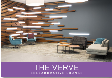
THE VERVE COLLABORATIVE LOUNGE