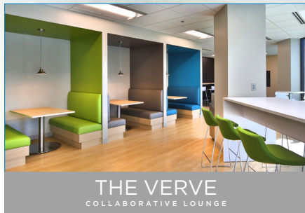
THE VERVE COLLABORATIVE LOUNGE