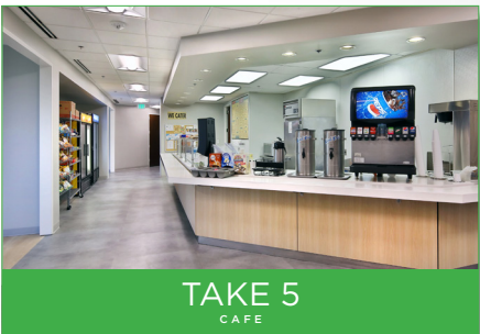
TAKE 5 CAFE