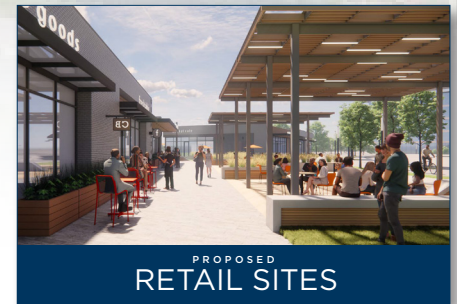
PROPOSED RETAIL SITES