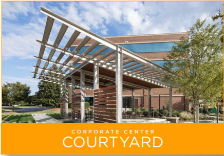
CORPORATE CENTER COURTYARD