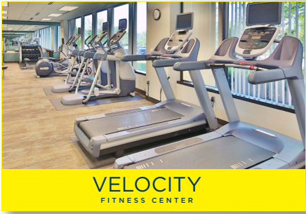
VELOCITY FITNESS CENTER