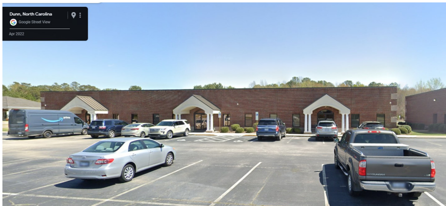
861 Tilghman Drive, Dunn, NC