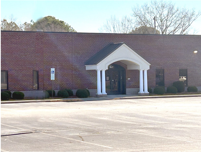
863 Tilghman Drive, Dunn, NC

861-863 Tilghman Drive, Dunn, North Carolina 28334