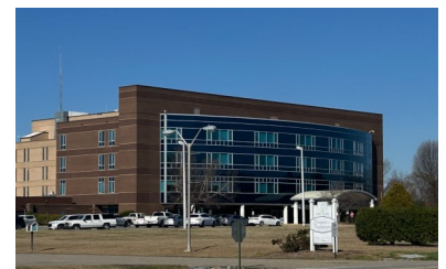
Betsy Johnson Memorial Hospital 800 Tilghman Drive, Dunn, NC