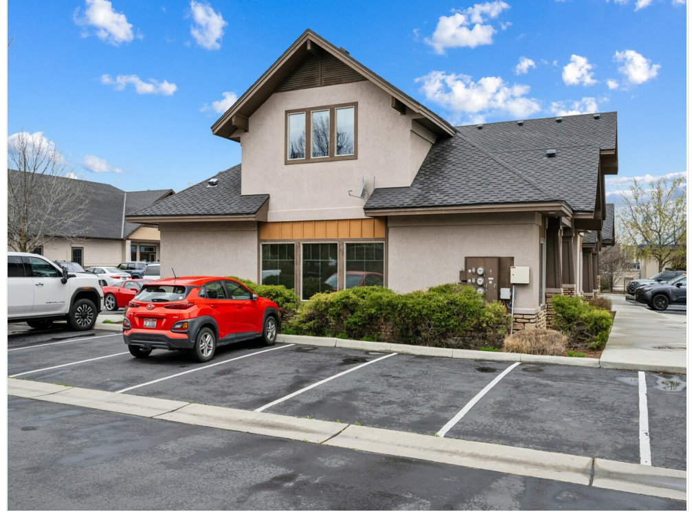
East side of Building Parking