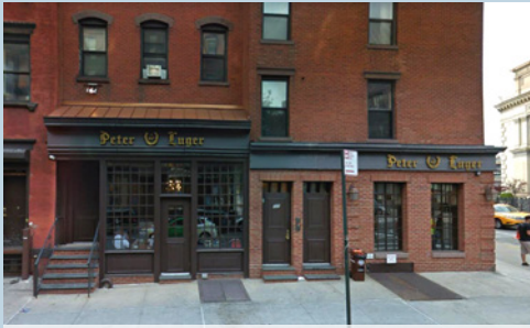
Peter Luger Steak House