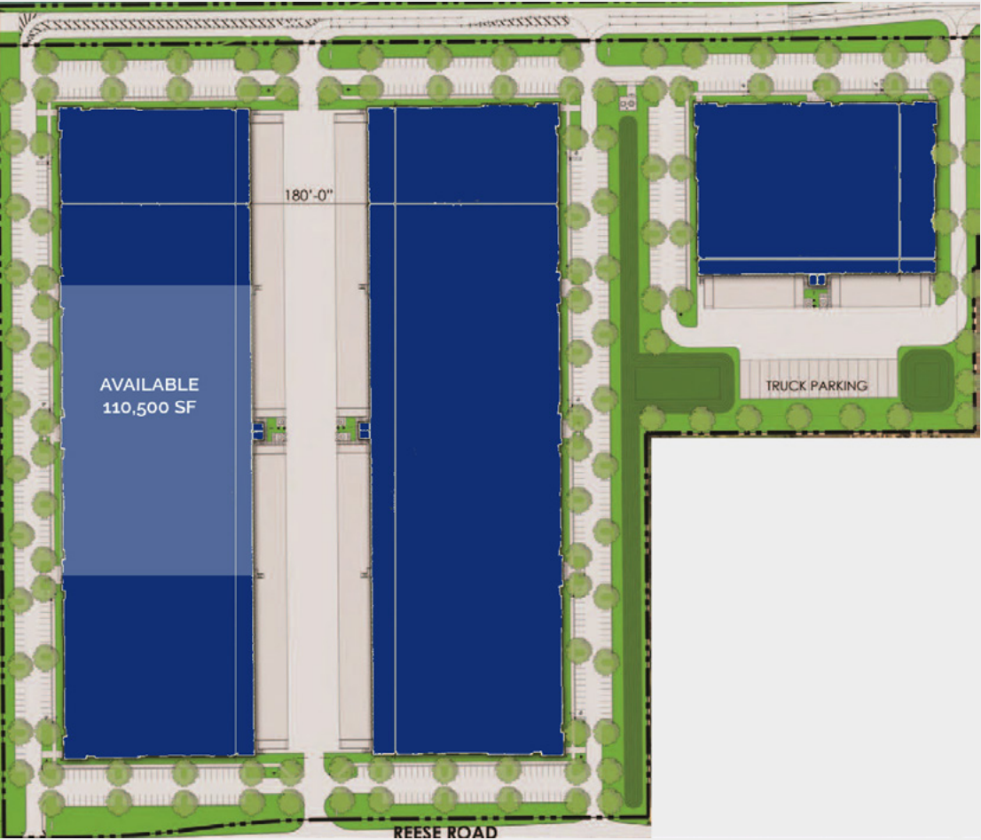
BUILDING 2 100,500 SF