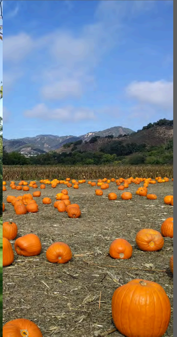
Lifestyle Concept at Pinenut Ranch

000 PINENUT RD | GARDNERVILLE, NEVADA 89410