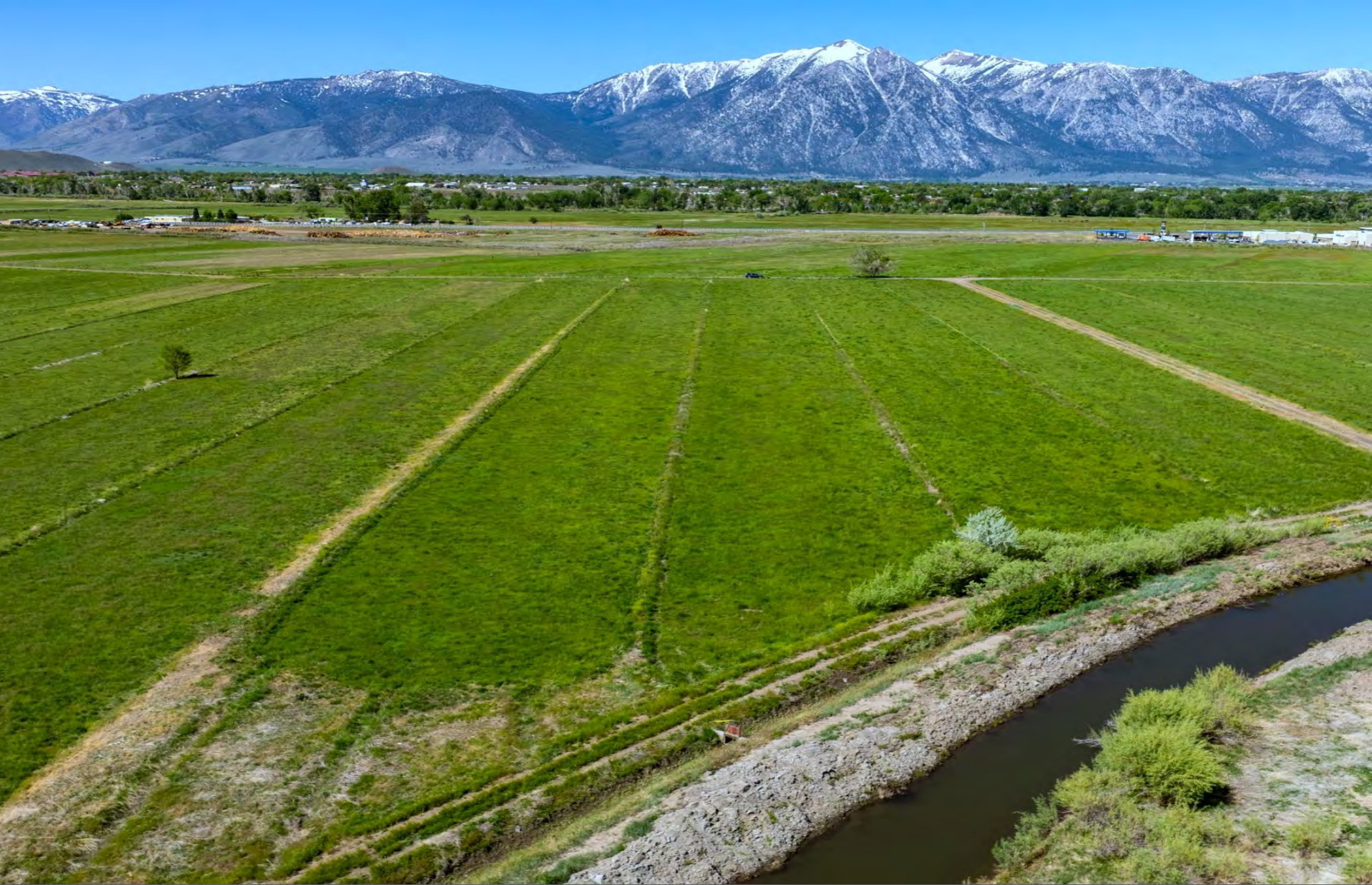
Spectacular Views of Jobs Peak and Carson Range

000 PINENUT RD | GARDNERVILLE, NEVADA 89410