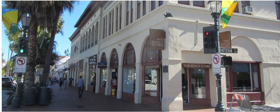
02 – Building exterior at corner of State St and Ortega St