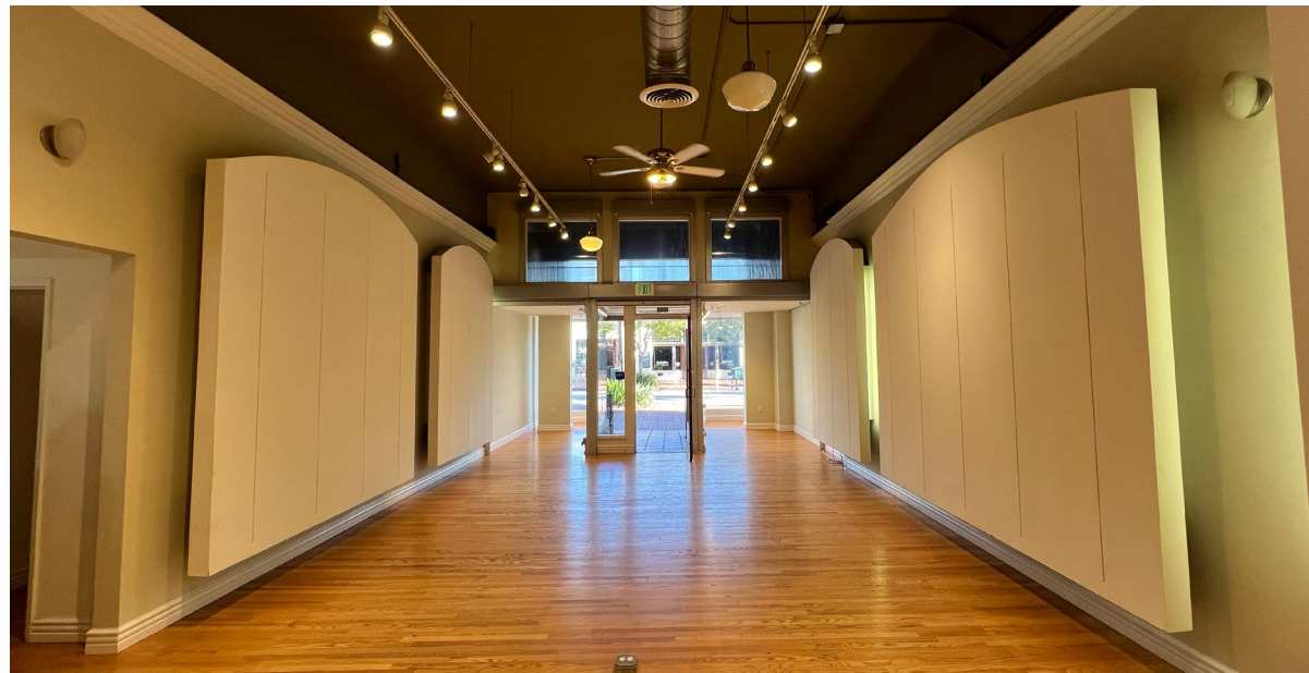
03 – 629 State Street renovated interior

The Fithian Building is a high foot traffic historic two-story retail and office building prominently located in the Center of Downtown Santa Barbara’s retail district. Retailers on this block include Vuori, Vans, World Market, Levi’s and Urban Outfitters. Additional nighttime foot traffic comes from M Special Brewing, Night Lizard Brewing, Yogurtland, and Tondi Gelato. The Fithian Building is also located near boutique hotels including Hotel Santa Barbara and The Drift Hotel.