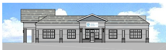
SOUTH ELEVATION SCALE: 3/32" = 1'-0"