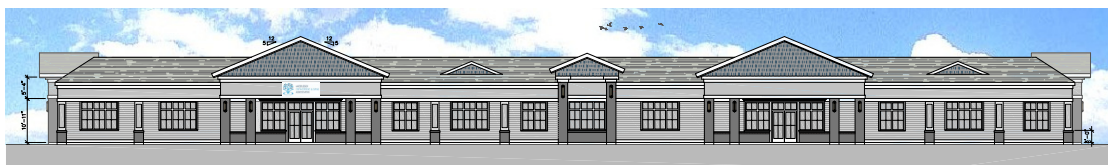
WEST ELEVATION SCALE: 3/32" = 1'-0"