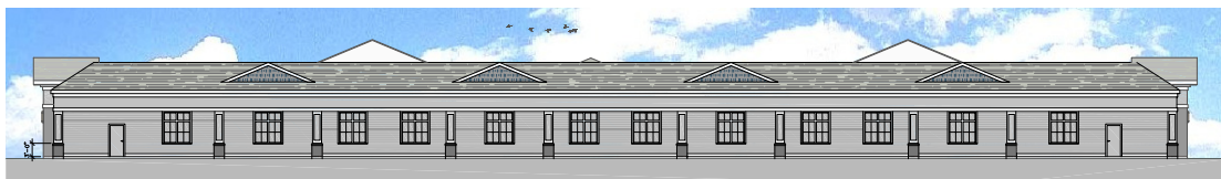
EAST ELEVATION SCALE: 3/32" = 1'-0"