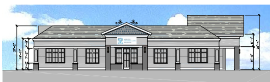
NORTH ELEVATION SCALE: 3/32" = 1'-0"