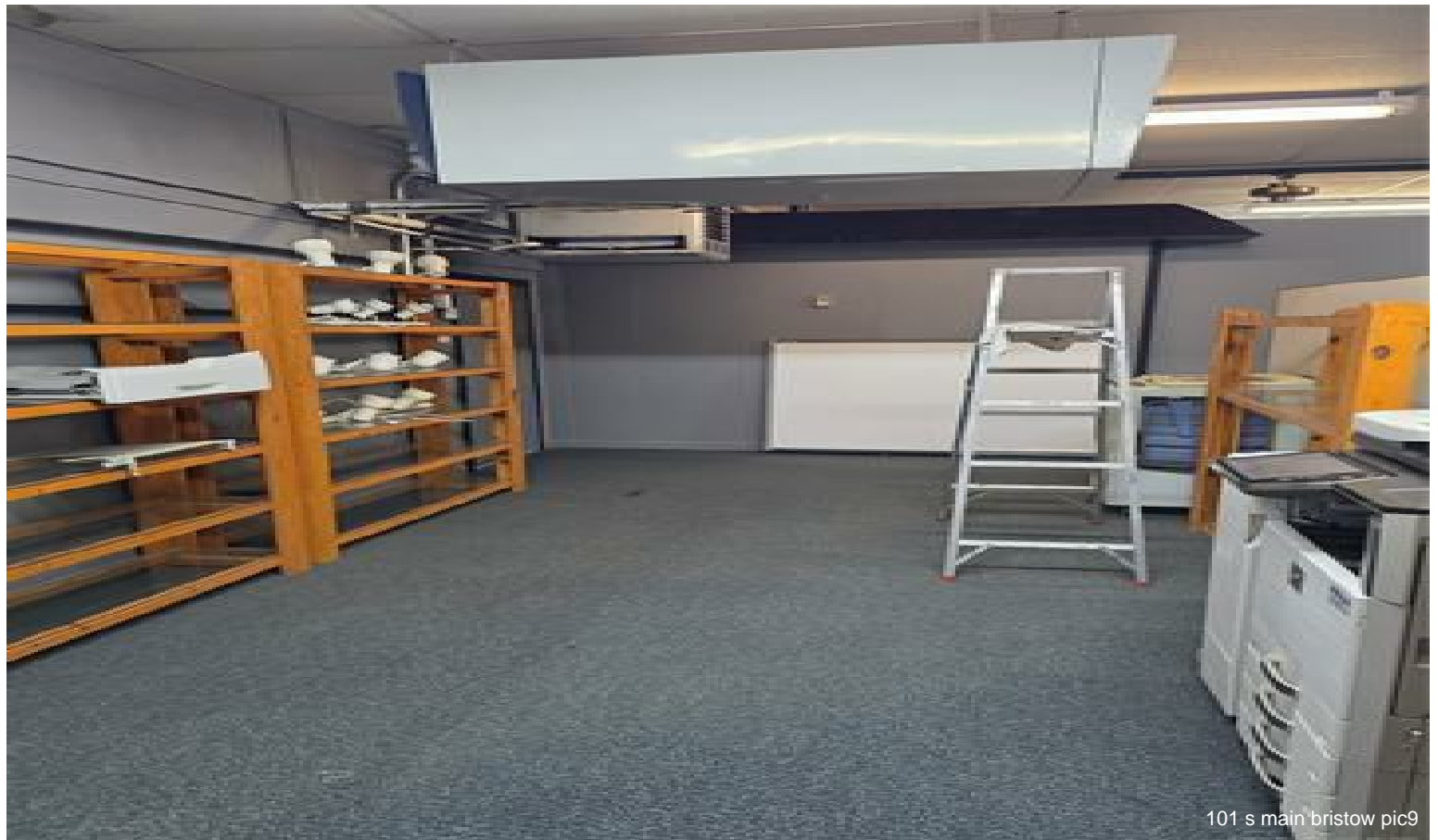
101 s main bristow pic9