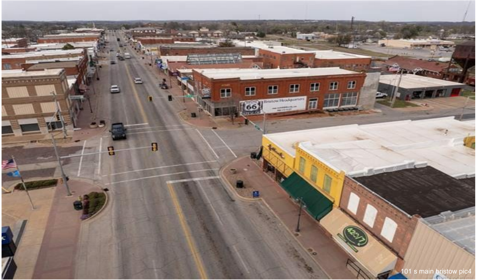
101 s main bristow pic4