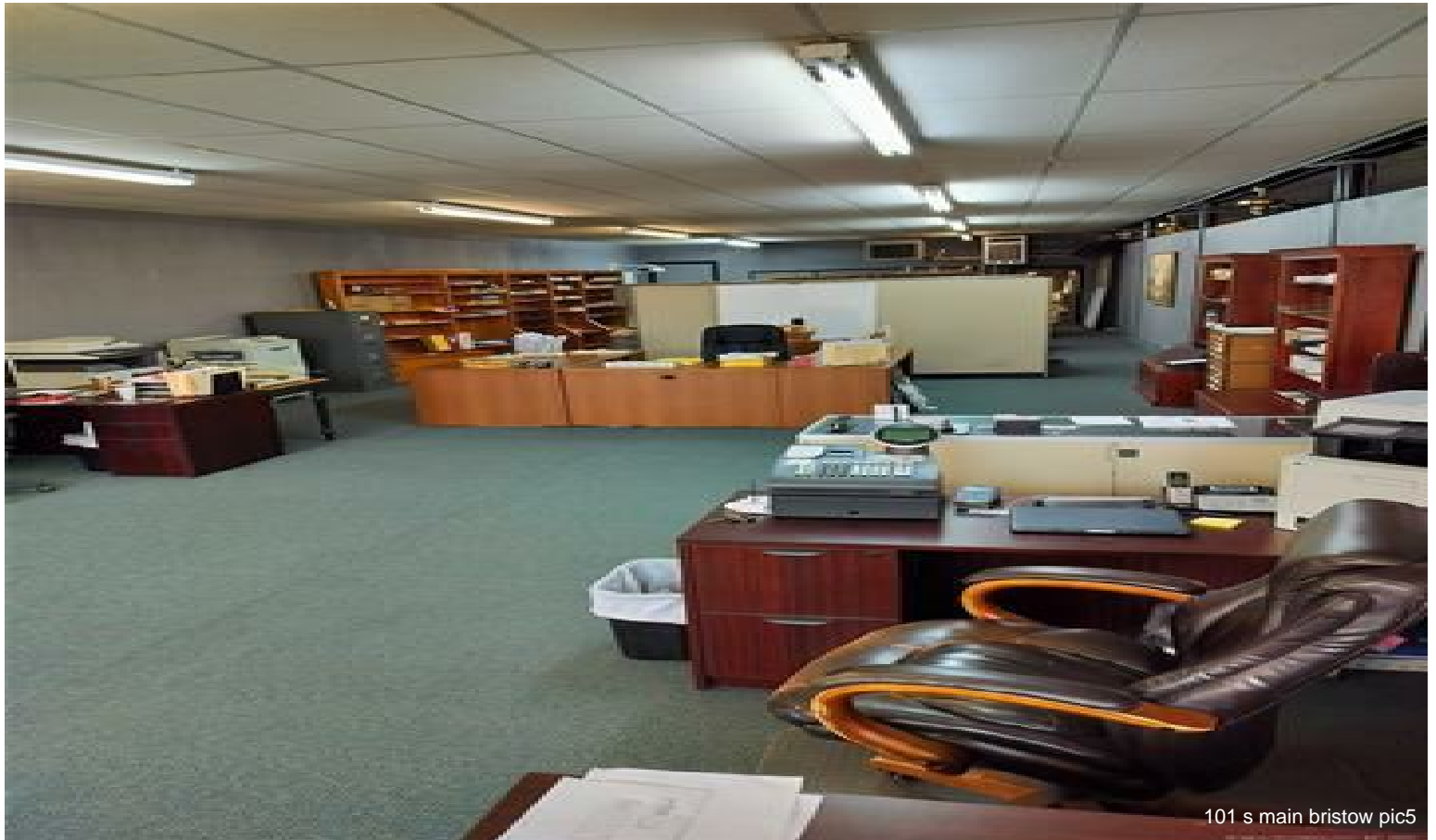
101 s main bristow pic5