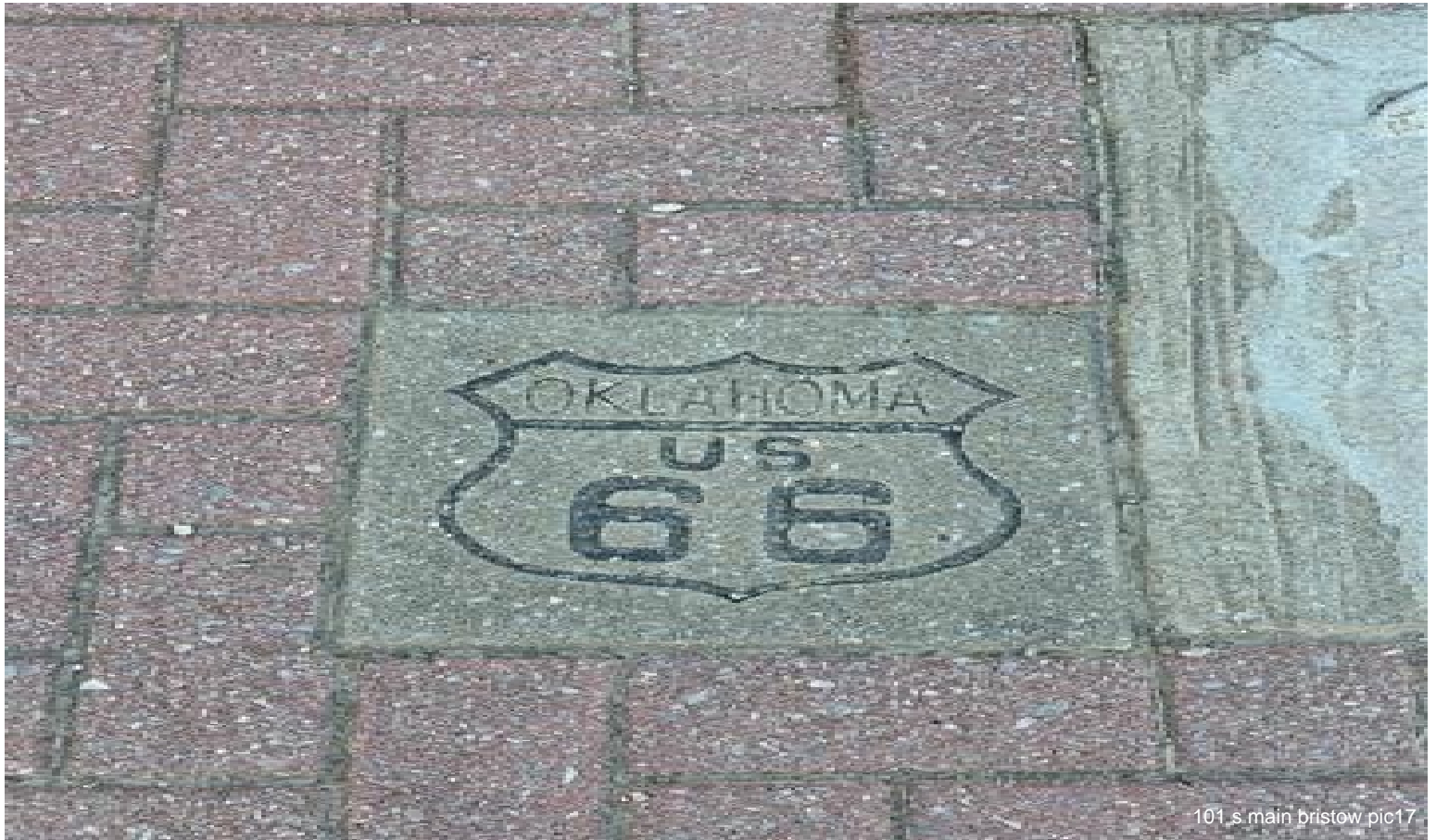
101 s main bristow pic17