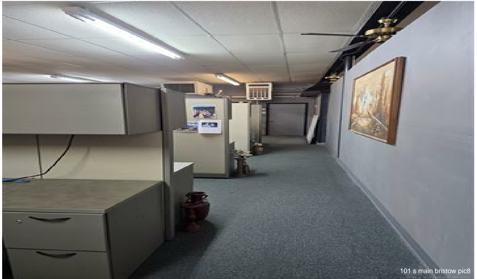
101 s main bristow pic8