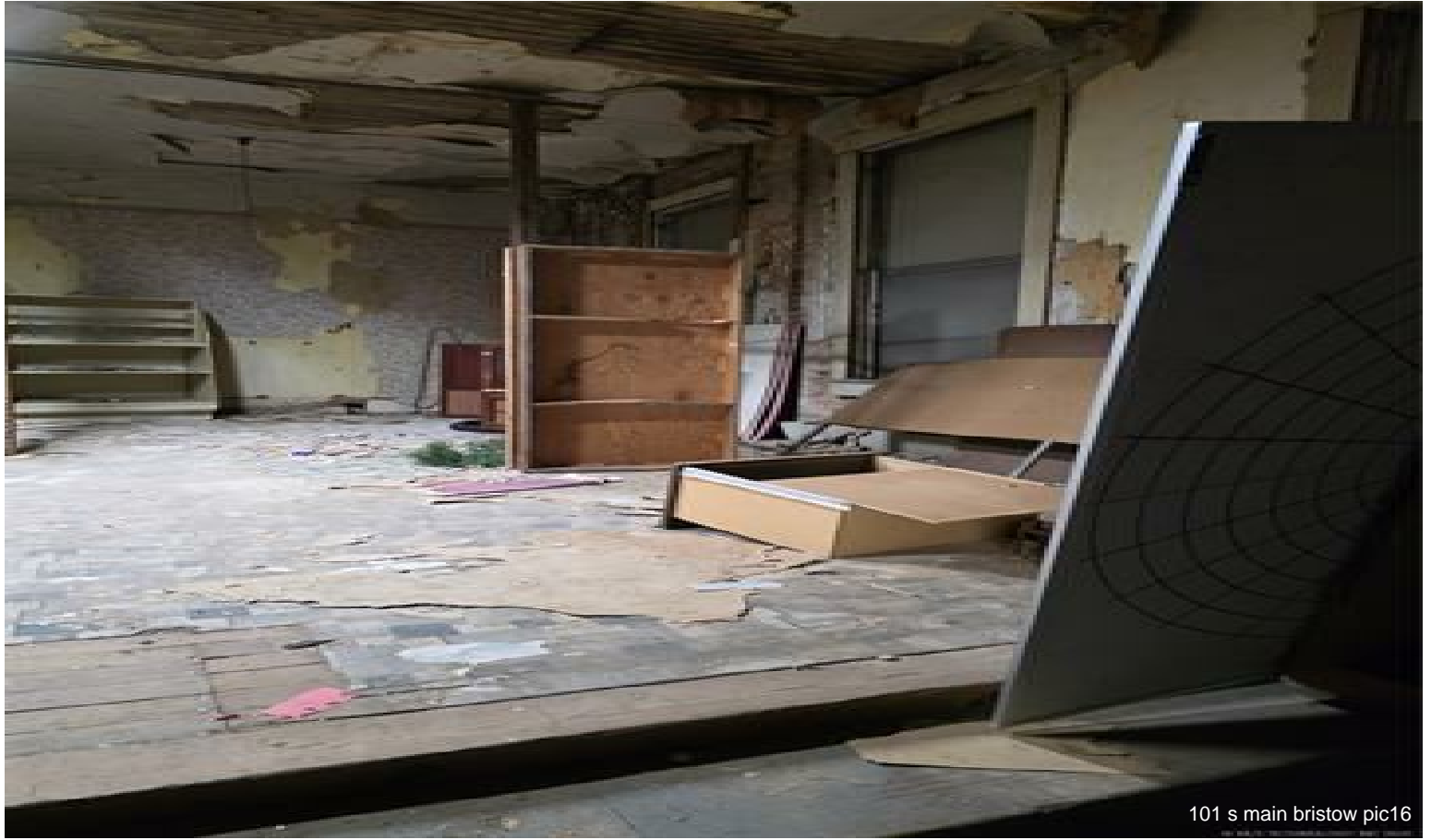
101 s main bristow pic16