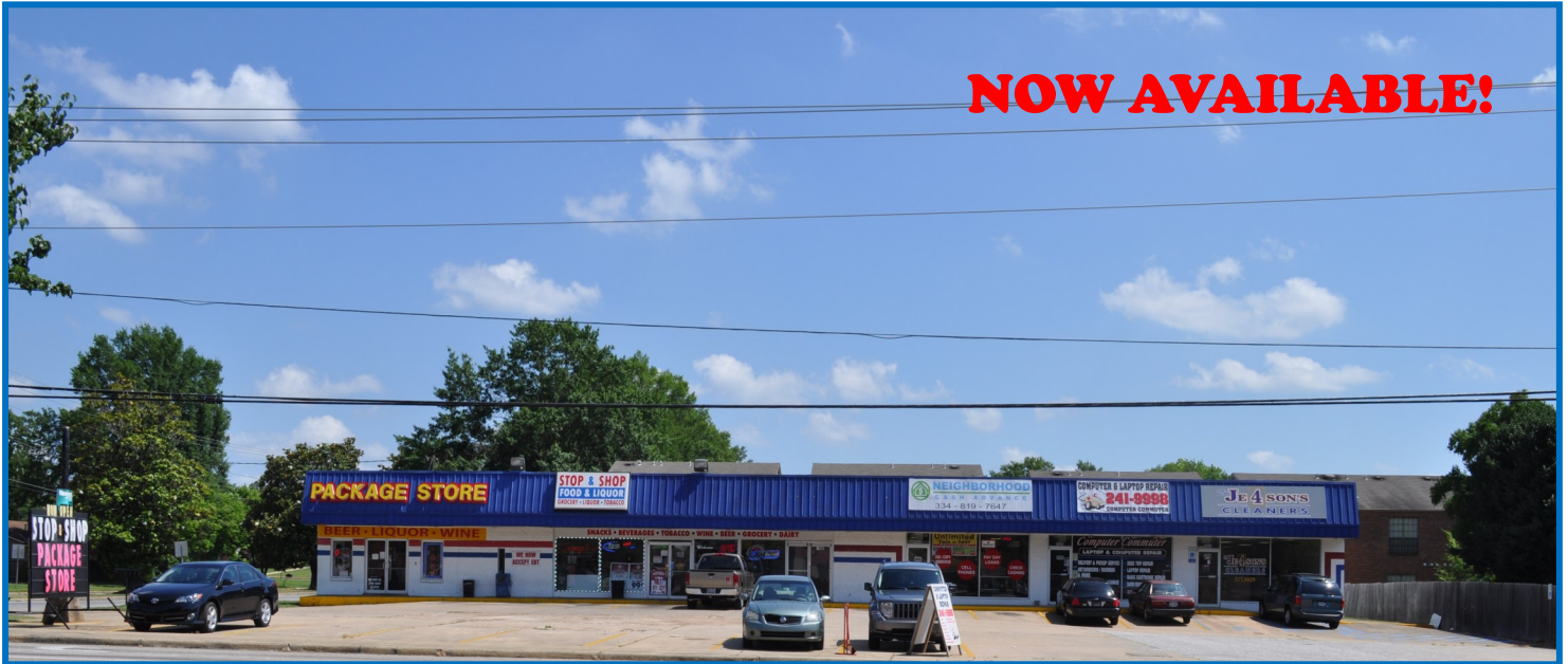
Meriwether Commercial Real Estate, LLC an Equal Opportunity Company. The information contained herein is from sources deemed reliable. No representation is made to the accuracy herein.

Convenience Store Package Store Anchored Strip Center