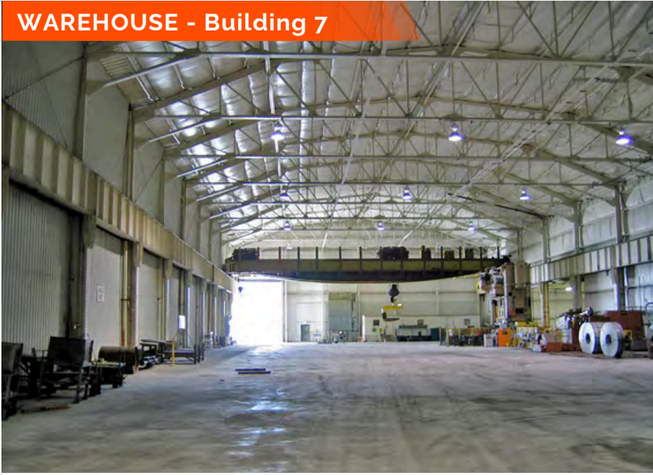
WAREHOUSE - Building 7