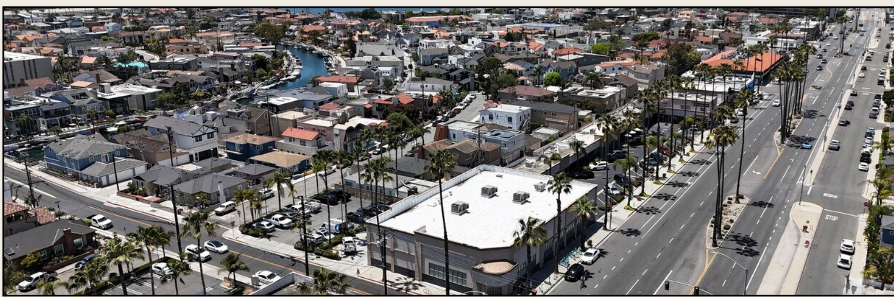
5670 2nd Street, Belmont Shore · Long Beach, CA · Corner of 2nd St & Ravenna Dr