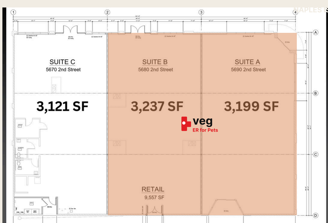
Suite C: 3,121 SF · Suite B: 3,237 SF · Suite A: 3,199 SF · Total Retail: 9,557 SF · Suites can be combined