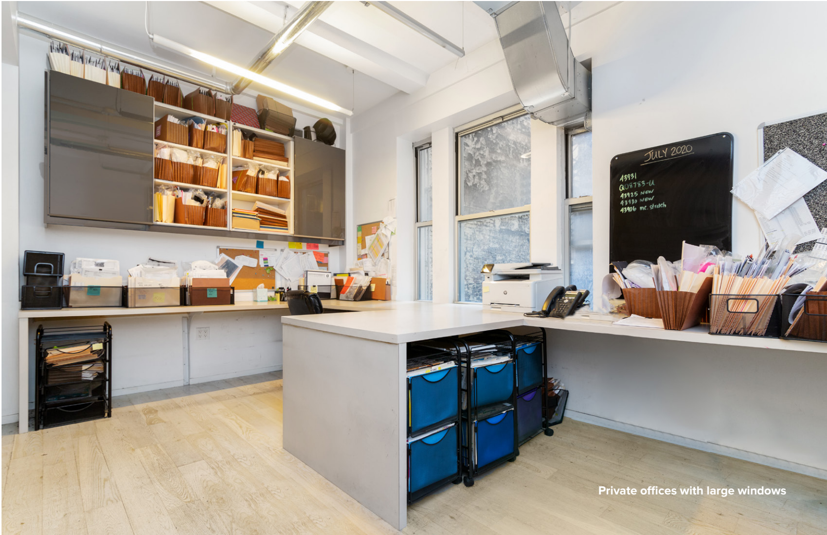
Private offices with large windows