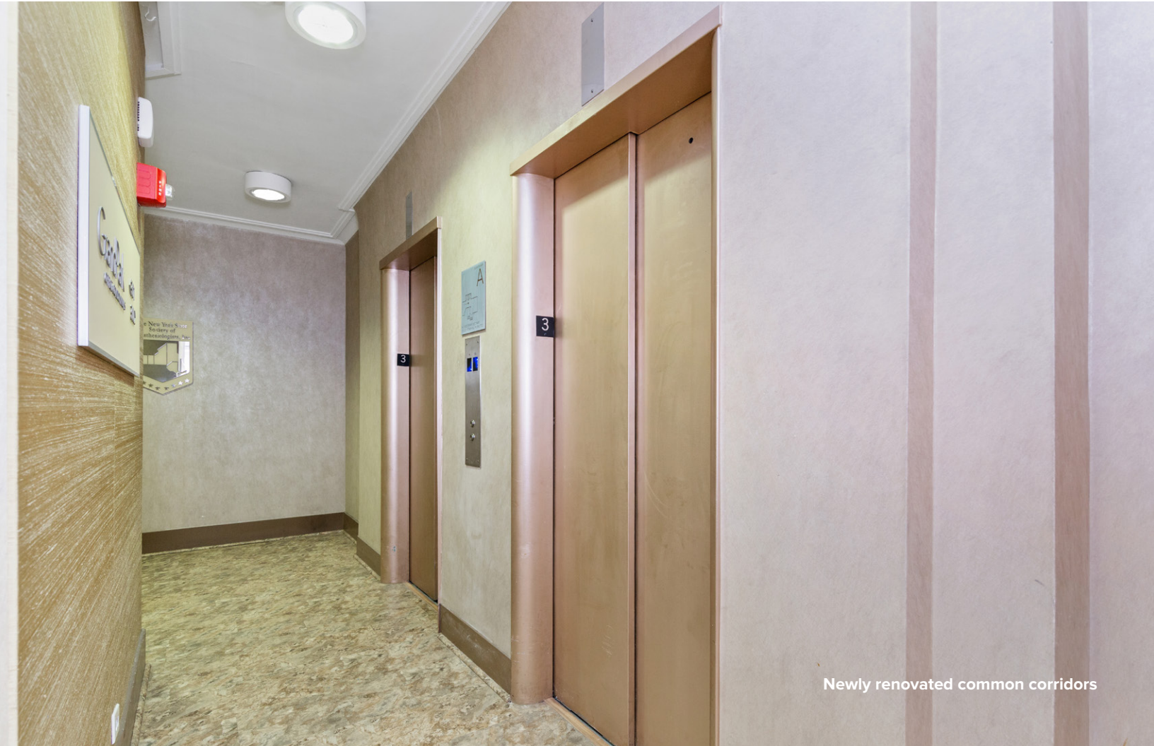
Newly renovated common corridors