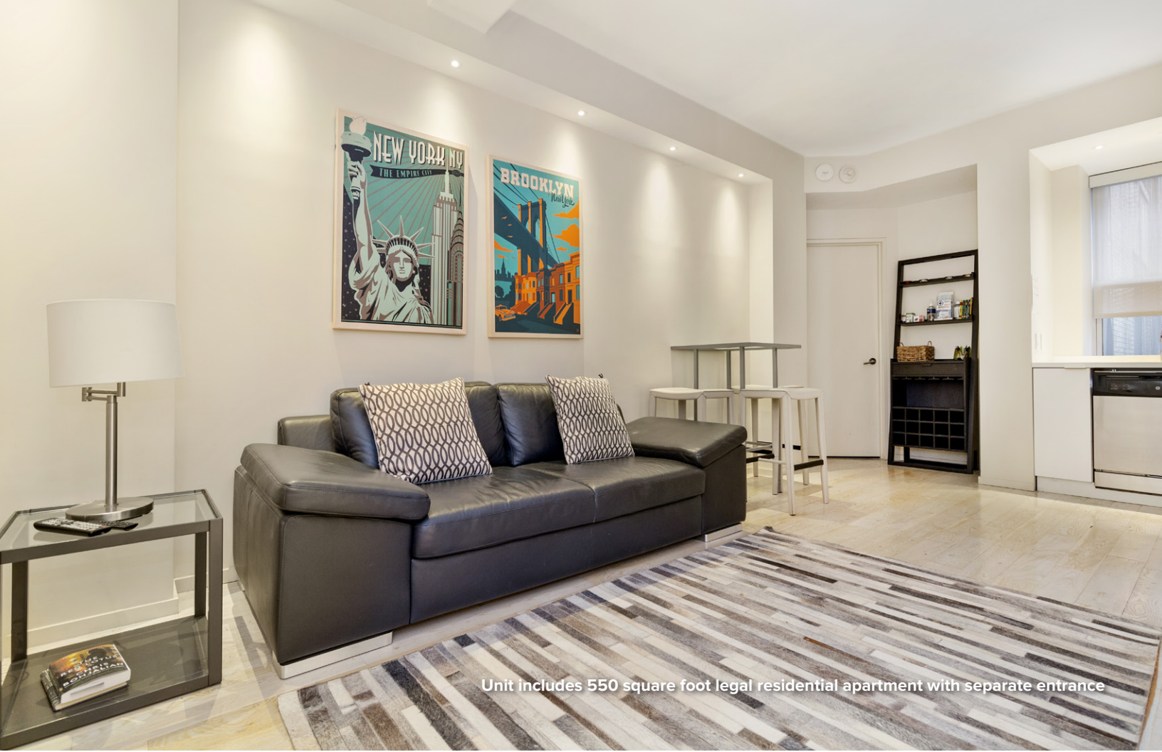
Unit includes 550 square foot legal residential apartment with separate entrance