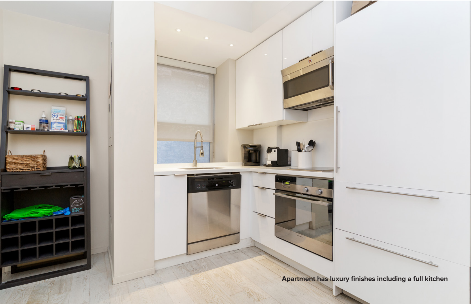
Apartment has luxury finishes including a full kitchen