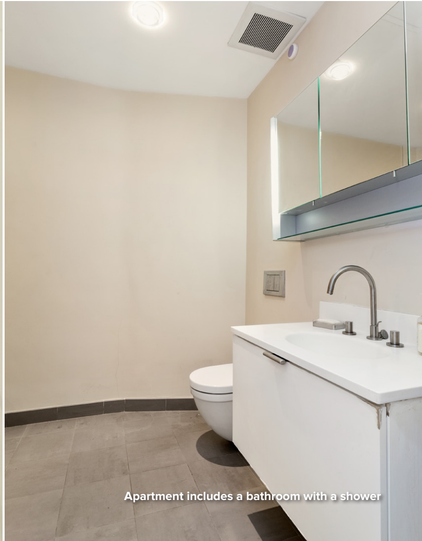
Apartment includes a bathroom with a shower