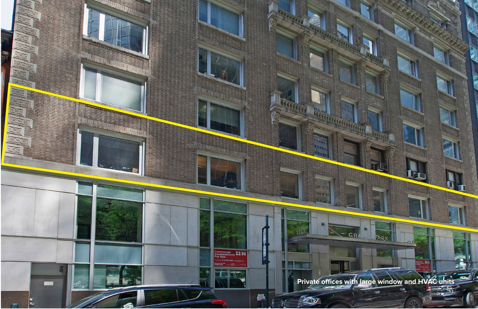
Private offices with large window and HVAC units