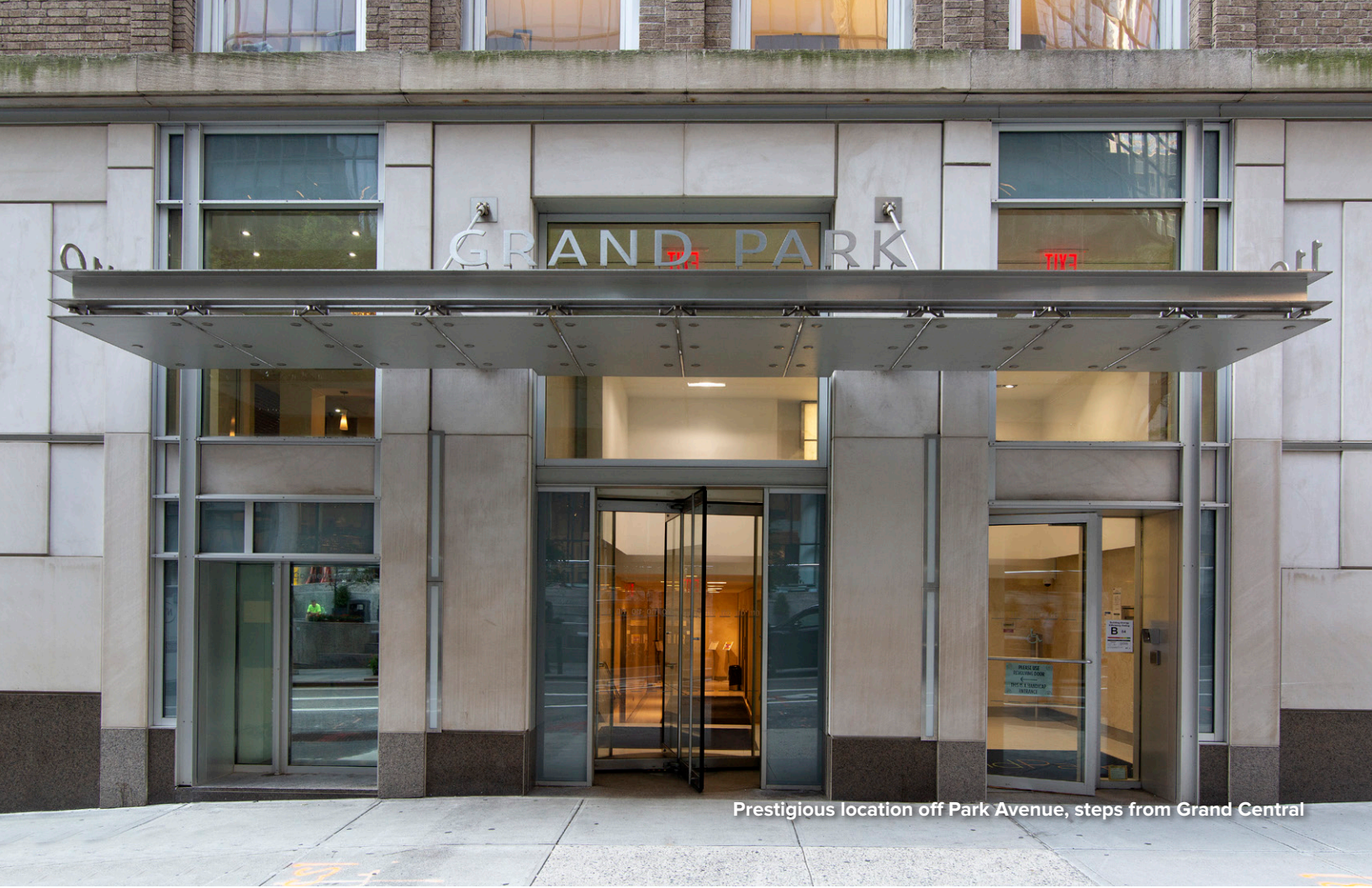
Prestigious location off Park Avenue, steps from Grand Central