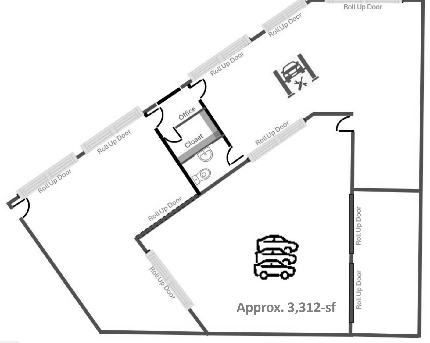
Floor plan is drawn with no scale

2502 Randolph Street, Huntington Park, CA 90255