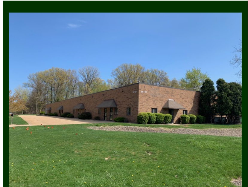
38127 Willoughby Pkwy, Willoughby, OH 44094

No warranty or representation, express or implied, is made as to the accuracy of the information contained herein. It is submitted subject to errors, omissions, price changes, rental or other conditions, withdrawal without notice, and to any special listing conditions imposed by our client.