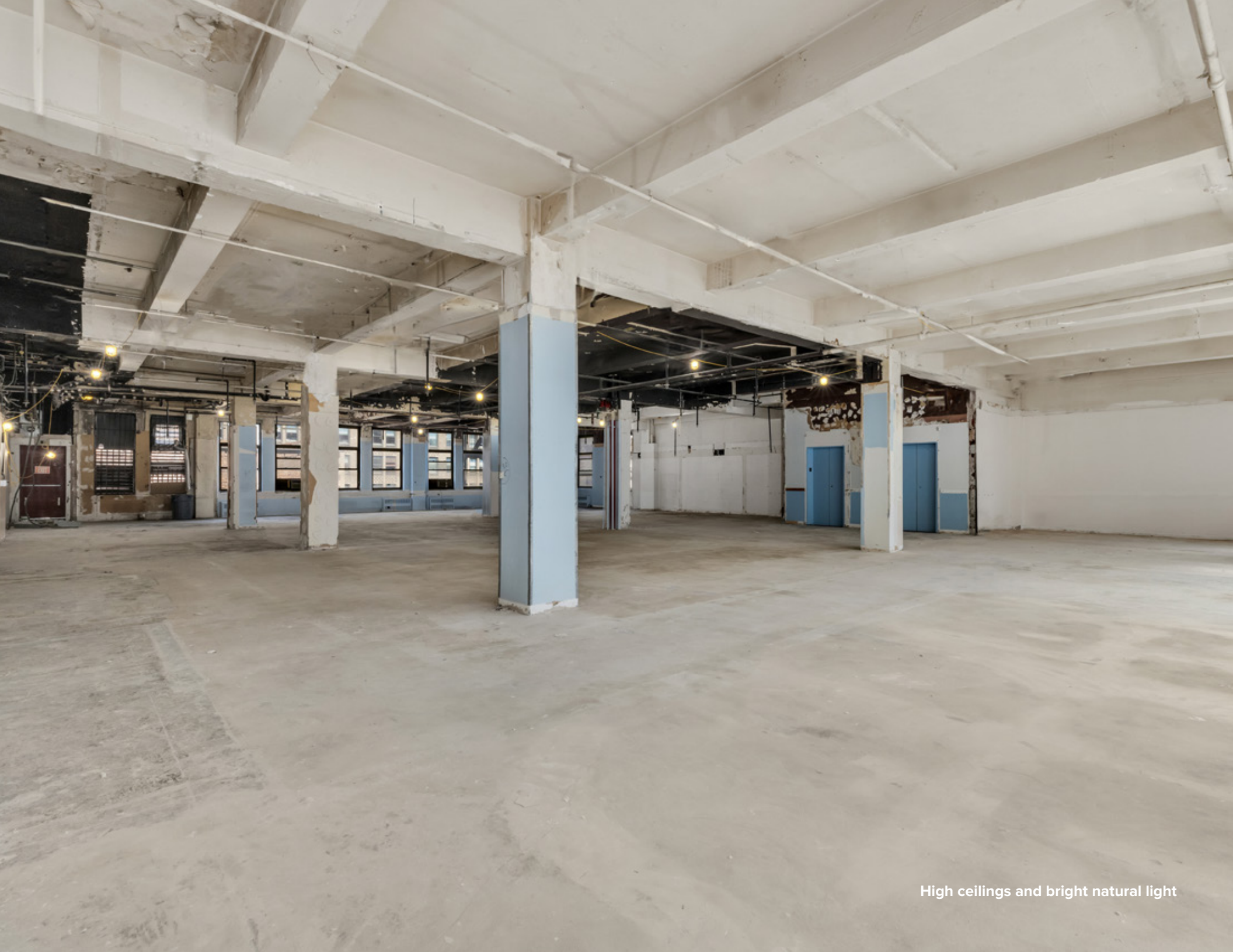
High ceilings and bright natural light