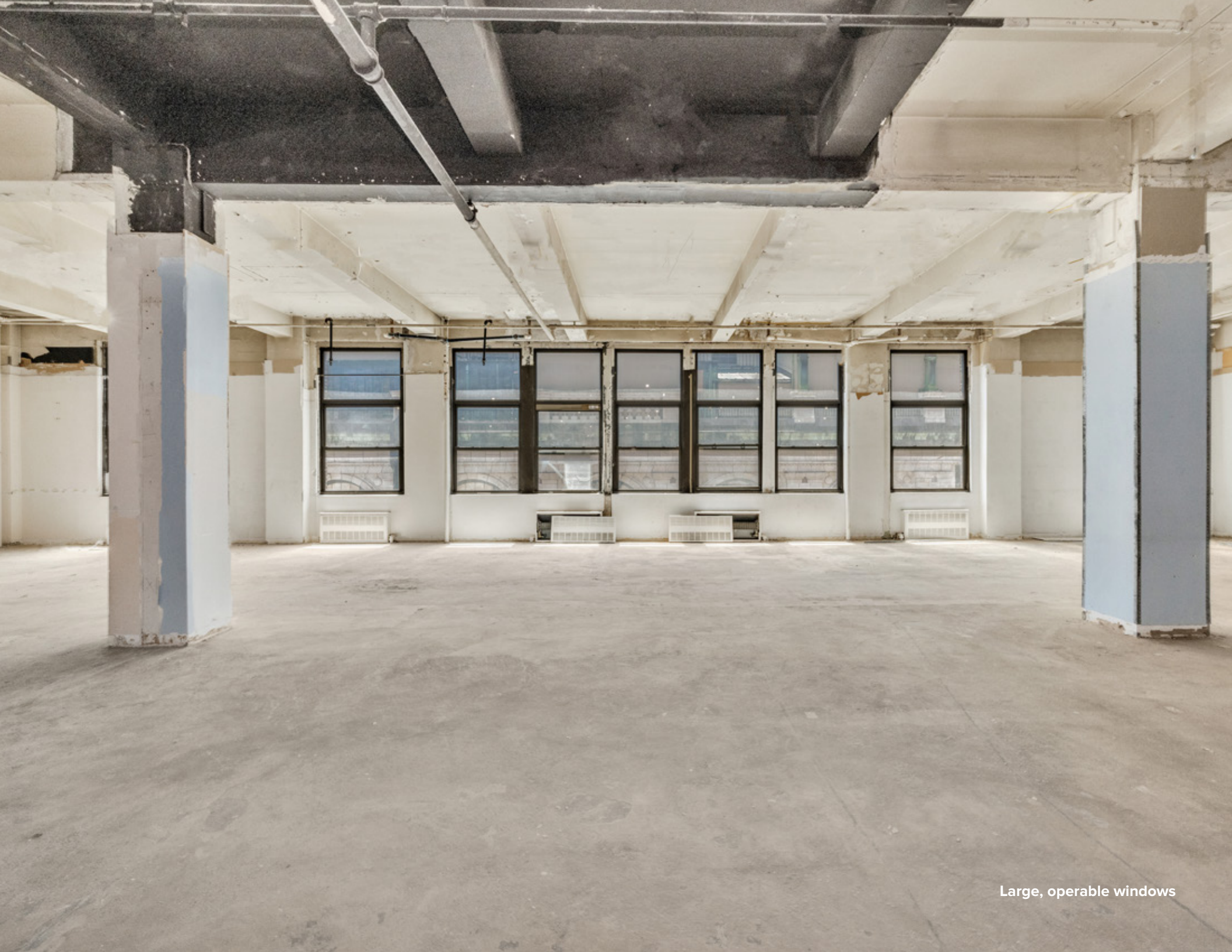
Large, operable windows