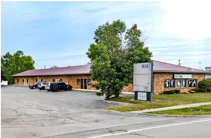
916 W COLISEUM BLVD.