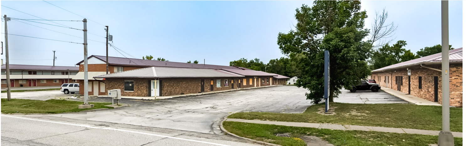
910 W COLISEUM BLVD.

916 W COLISEUM BLVD, FORT WAYNE, IN 46808