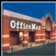
810 Spring Lane Sanford, NC