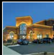
Westover Gallery Greensboro, NC