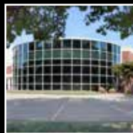
809 Green Valley Rd. Greensboro, NC