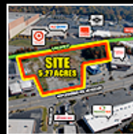
2414 Battleground Greensboro, NC