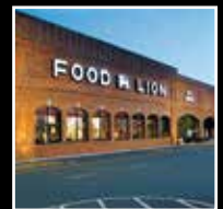
Summerfield Renaissance Summerfield, NC