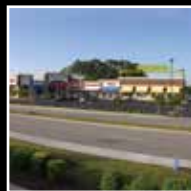
501 Village Myrtle Beach, SC