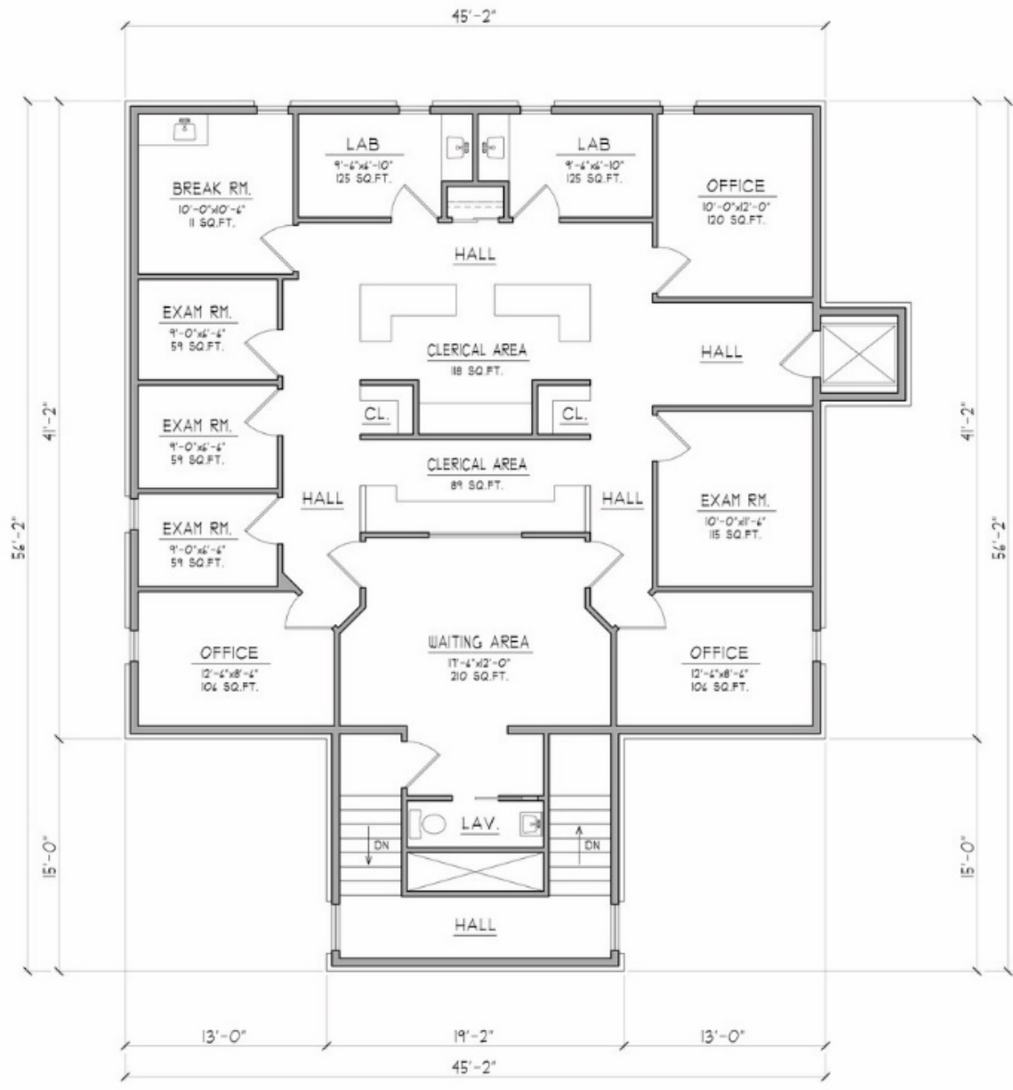
EXISTING 2ND LEVEL FLOOR PLAN SCALE: 1/4" = 1'-0"