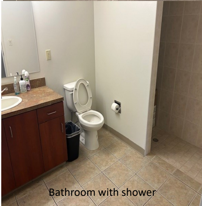
Bathroom with shower