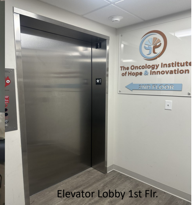
Elevator Lobby 1st Flr.