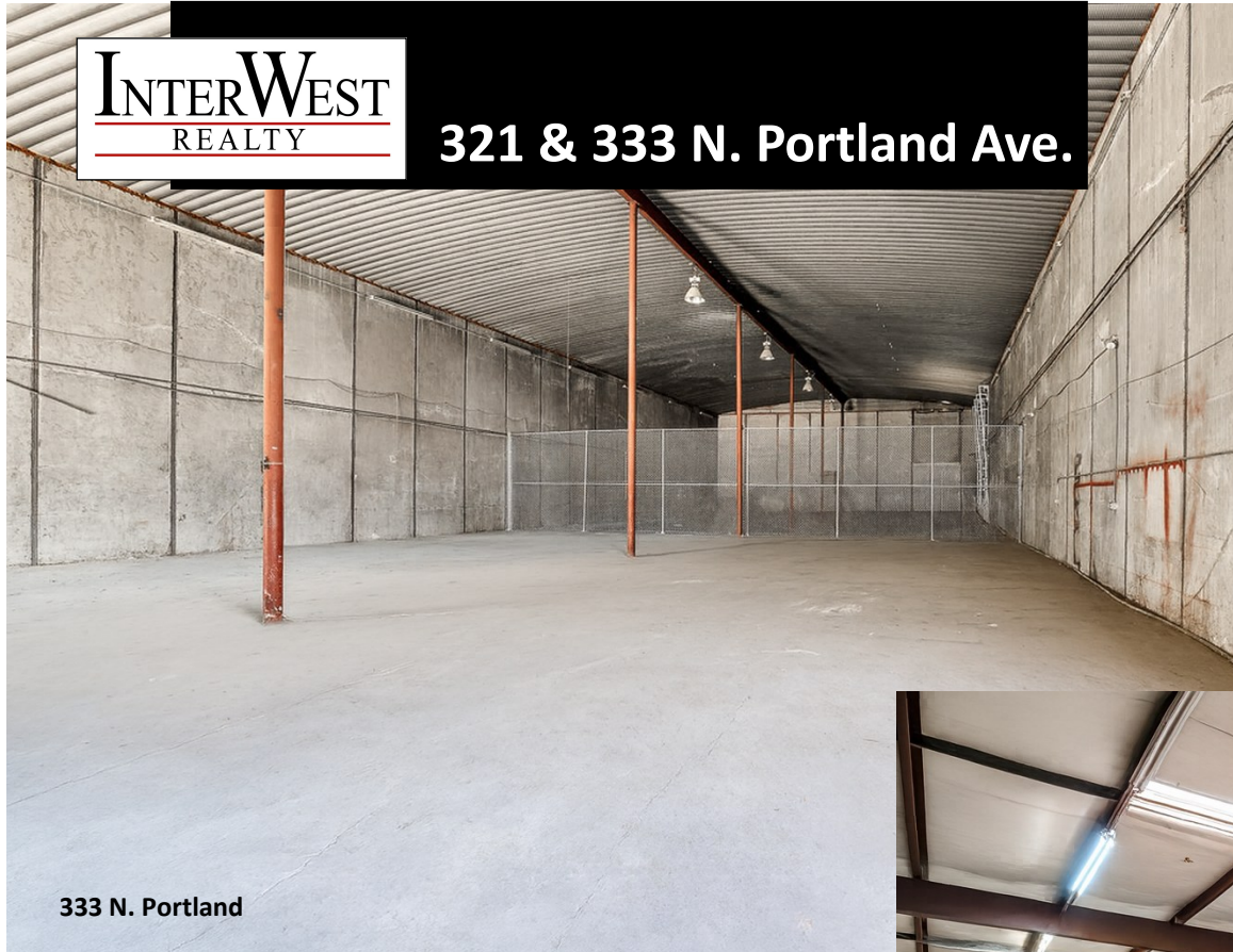
333 N. Portland