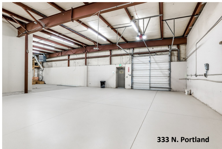
333 N. Portland