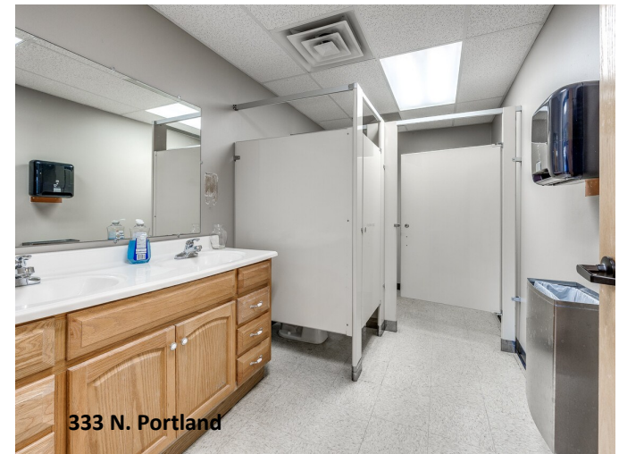
333 N. Portland