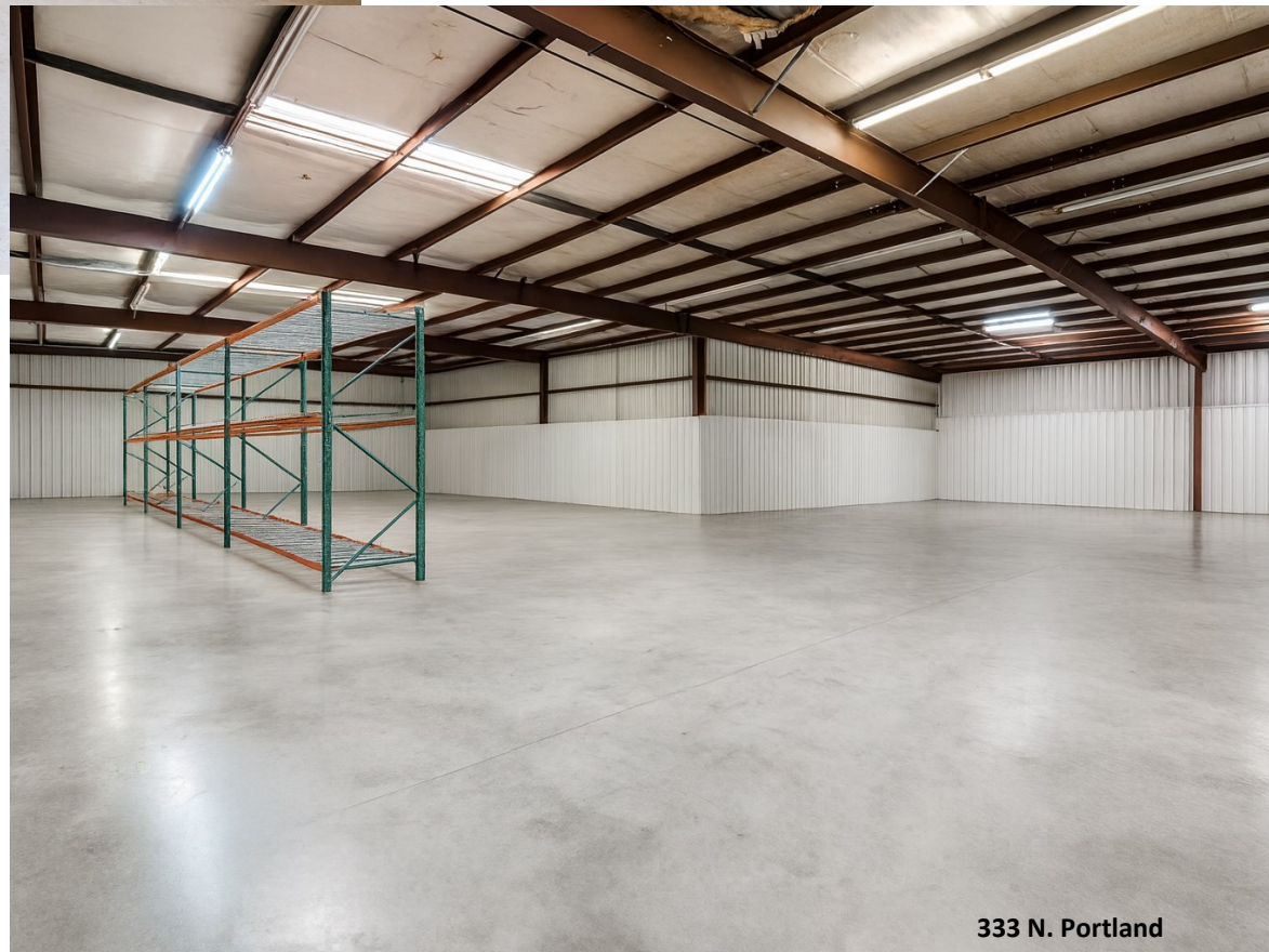
333 N. Portland