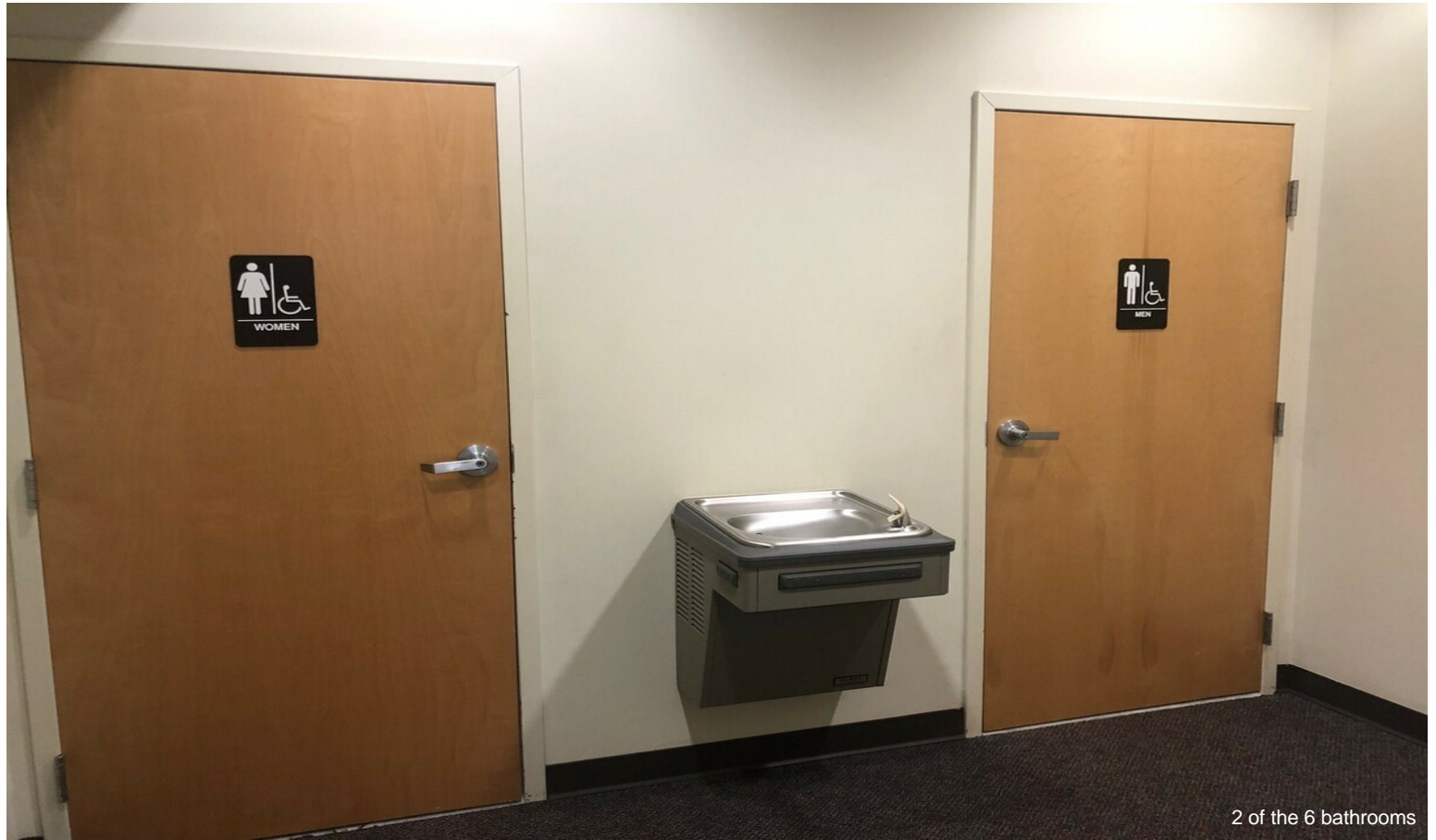
2 of the 6 bathrooms