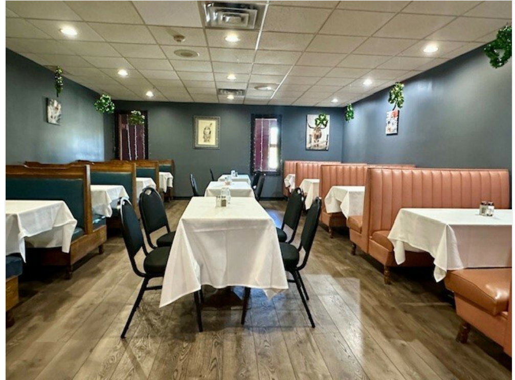
Dining Room Booths