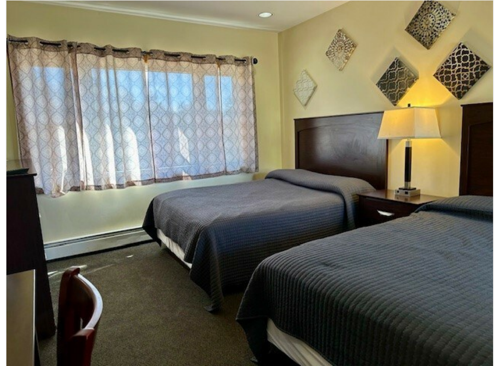
Double - Double Guestroom