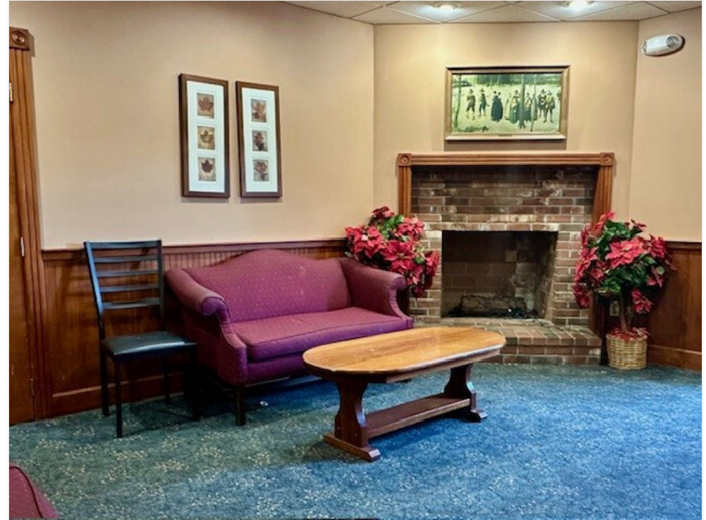
Banquet Reception Lobby