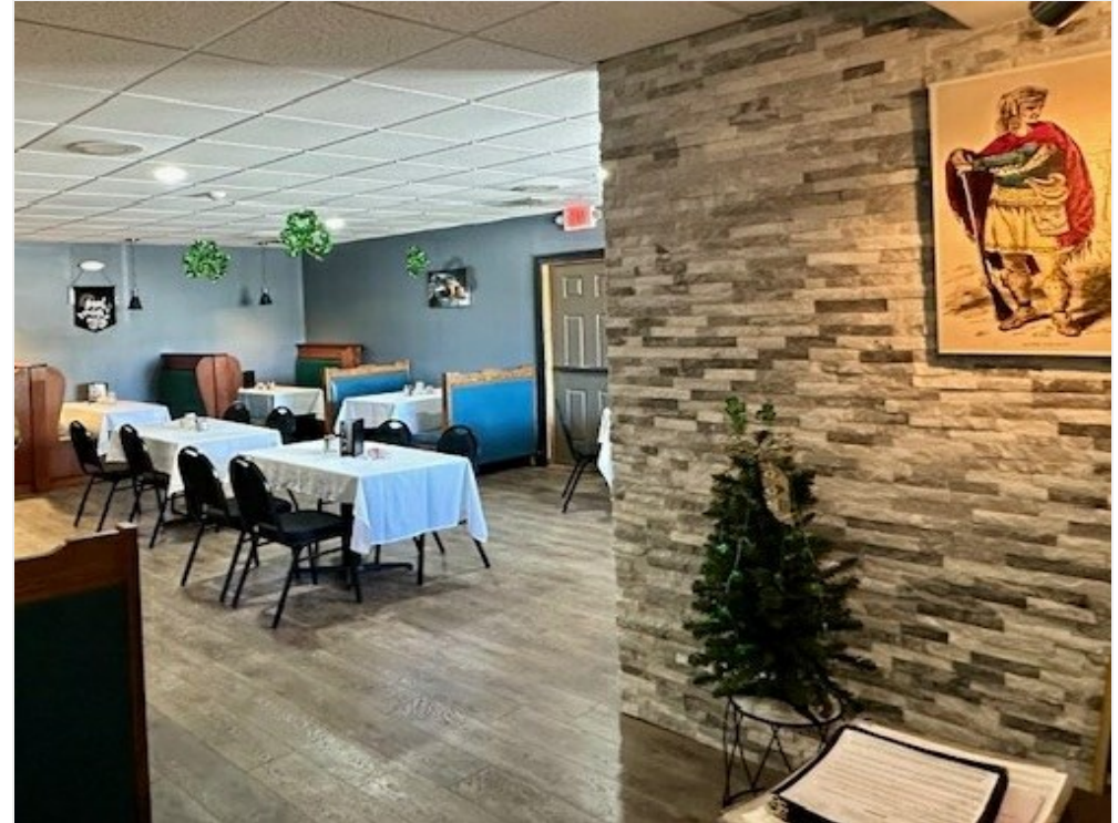
Front Dining Room