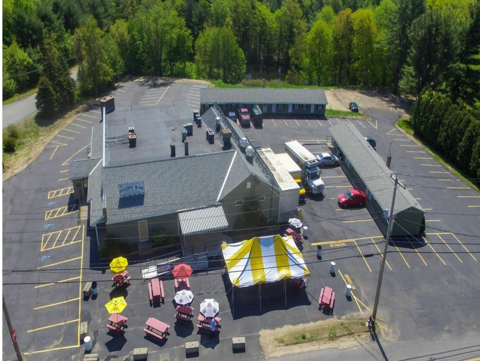
King Phillip Restaurant, Motel, Parking