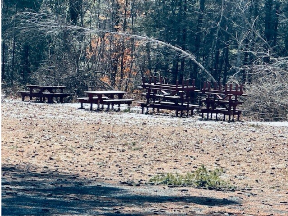
Five Wooded Acres