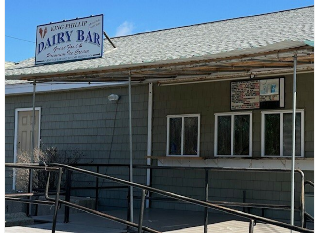
Dairy Bar Walk Up Window