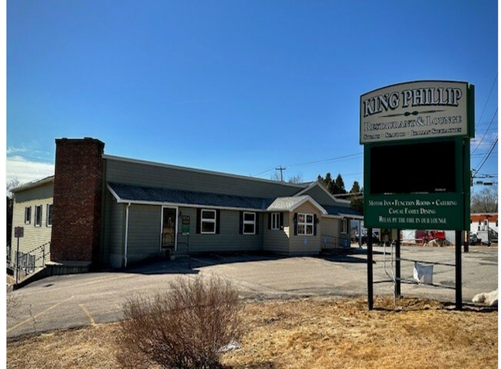
King Phillip Restaurant & Motel