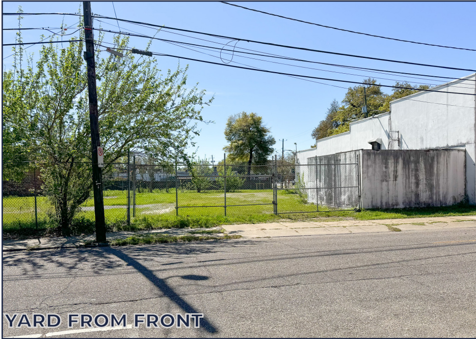
YARD FROM FRONT