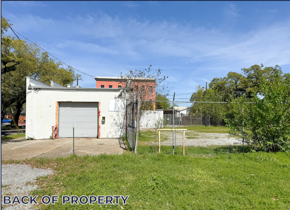
BACK OF PROPERTY