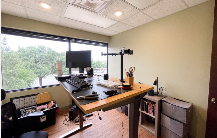
Suite 206 - 3