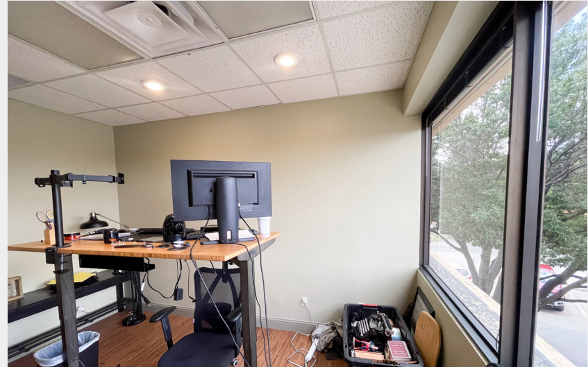
Suite 206 - Common Areas