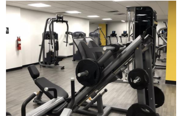
First Place Fitness Center