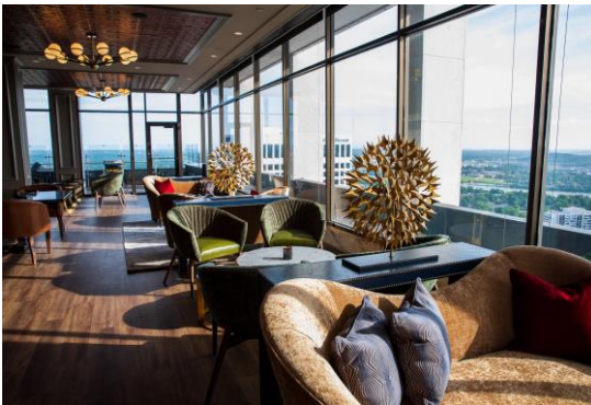
The Summit Club