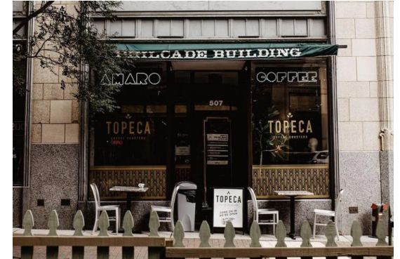
Topeca Coffee – Philcade Building