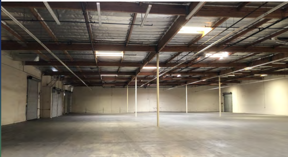
Warehouse (Photo Taken While Vacant)