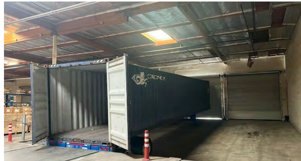
Two (2) Interior Truck Wells