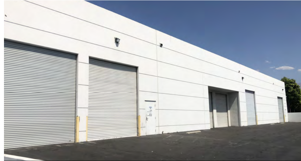
Ground Level Roll-up Doors