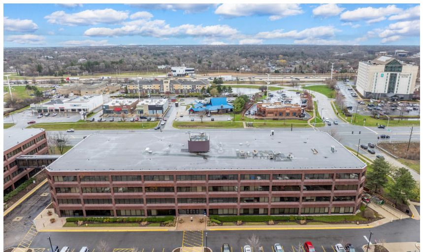
700 E BUTTERFIELD