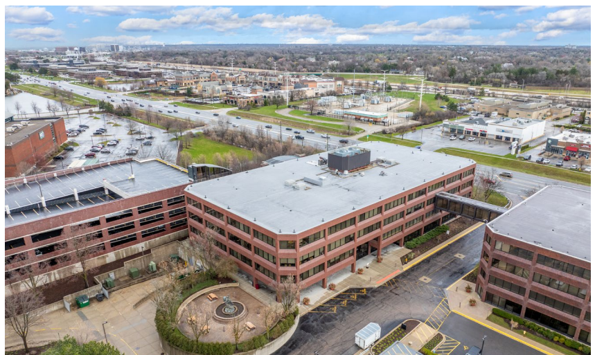
720 E BUTTERFIELD