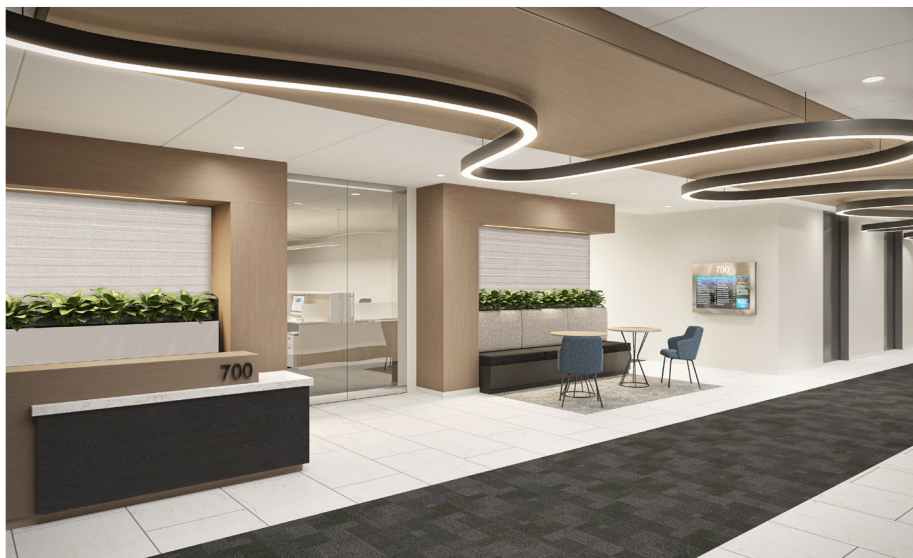
MAIN LOBBY, ELEVATOR LOBBIES & RESTROOMS