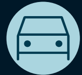
Secure Underground Parking