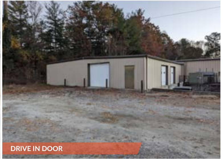
DRIVE IN DOOR