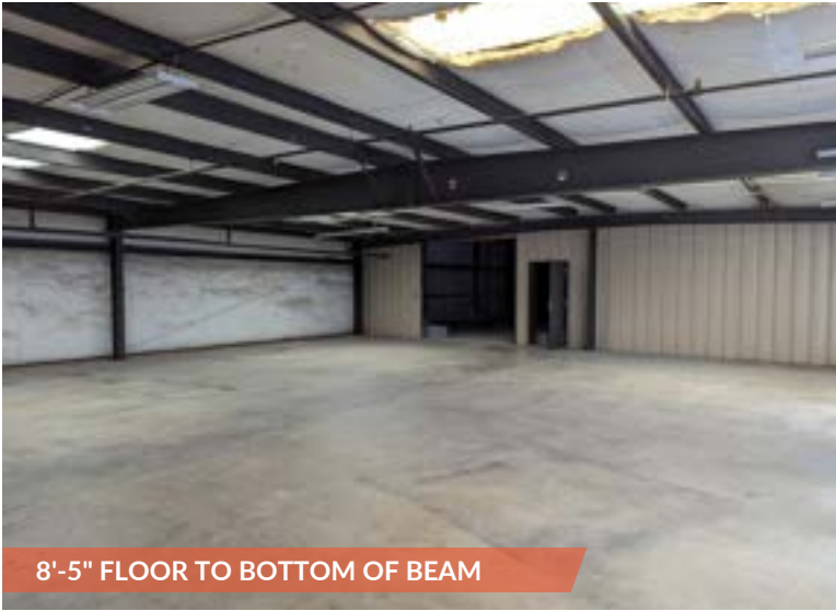
8'-5" FLOOR TO BOTTOM OF BEAM