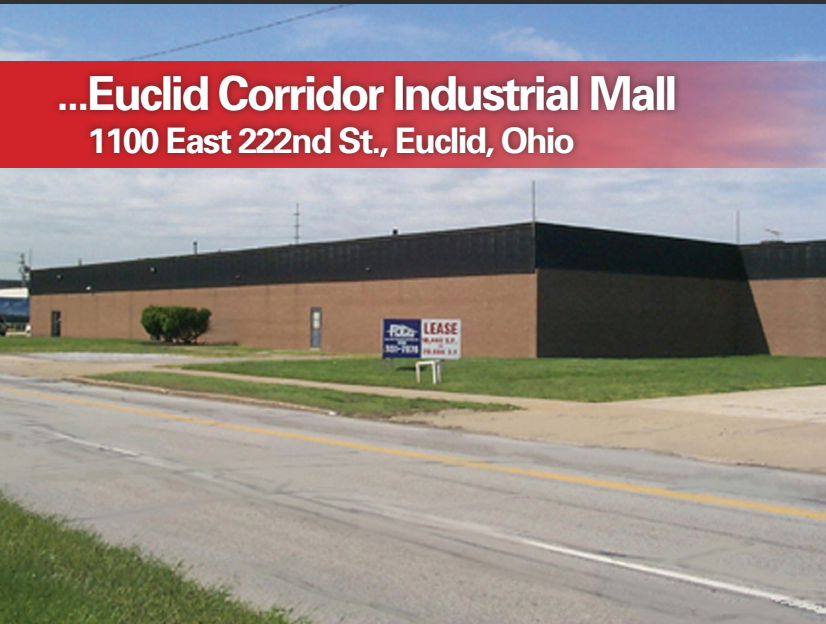
...Euclid Corridor Industrial Mall 1100 East 222nd St., Euclid, Ohio