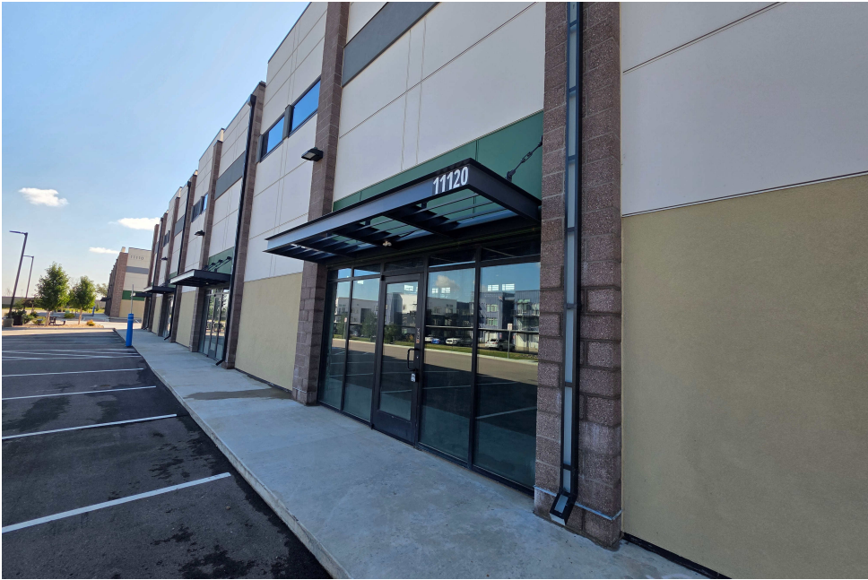
11120 Broomfield Lane