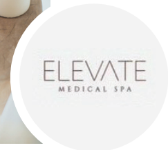
ELEVATE MED SPA