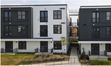
ARCADE AT THE ANNEX