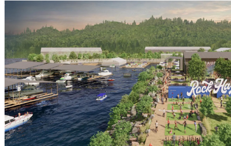
ROCK HARBOR MARINA