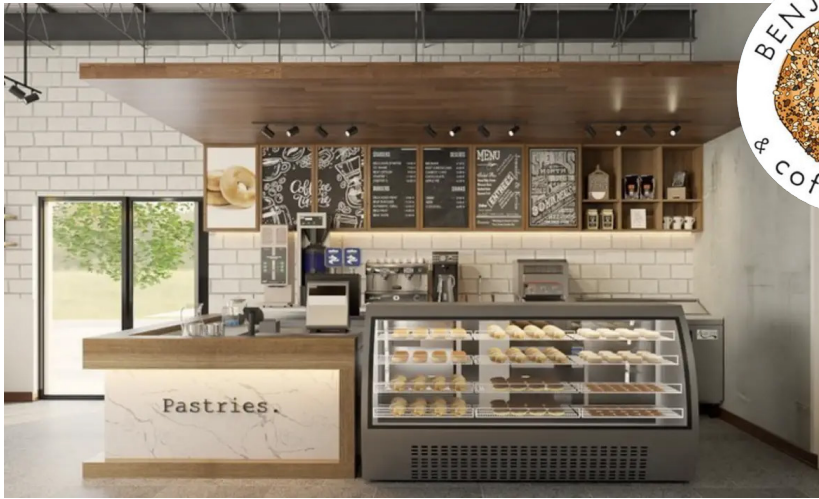
BENJI'S BAGEL + COFFEE HOUSE