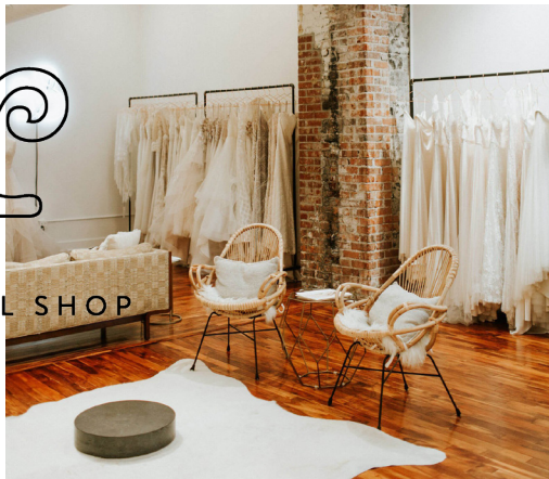
A & BÉ BRIDAL