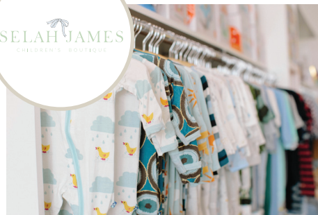
SELAH JAMES CHILDREN'S BOUTIQUE