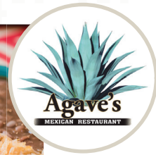
AGAVE'S MEXICAN RESTAURANT