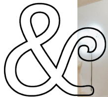
A & BÉ BRIDAL SHOP