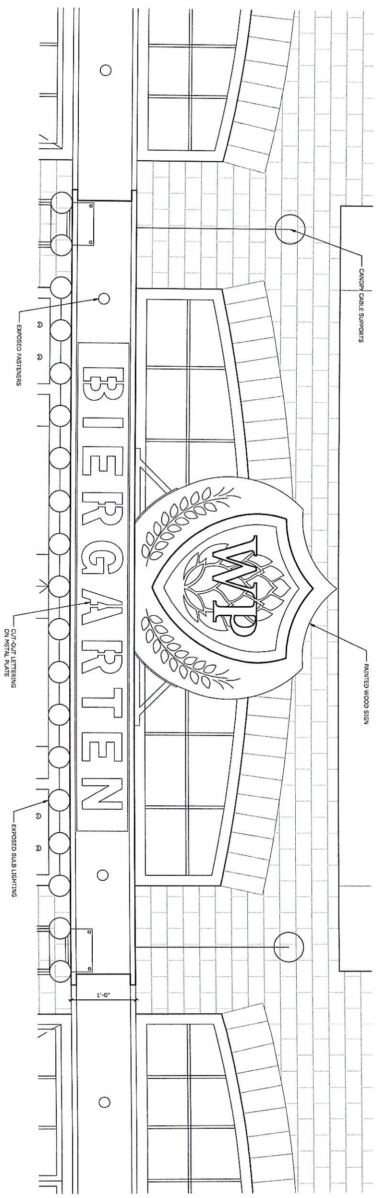
2 ENLARGED FRONT SIGN ELEVATION A-4.2 1-1/2"=1'-0"

This drawing and the information contained herein are the property of Gregg Wies & Gardner Architects, LLC. It is to be used only for the project and location specified. No part of this drawing may be reproduced or transmitted in any form or by any means, electronic, mechanical, photocopying, recording, or by any information storage and retrieval system, without the prior written permission of Gregg Wies & Gardner Architects, LLC.