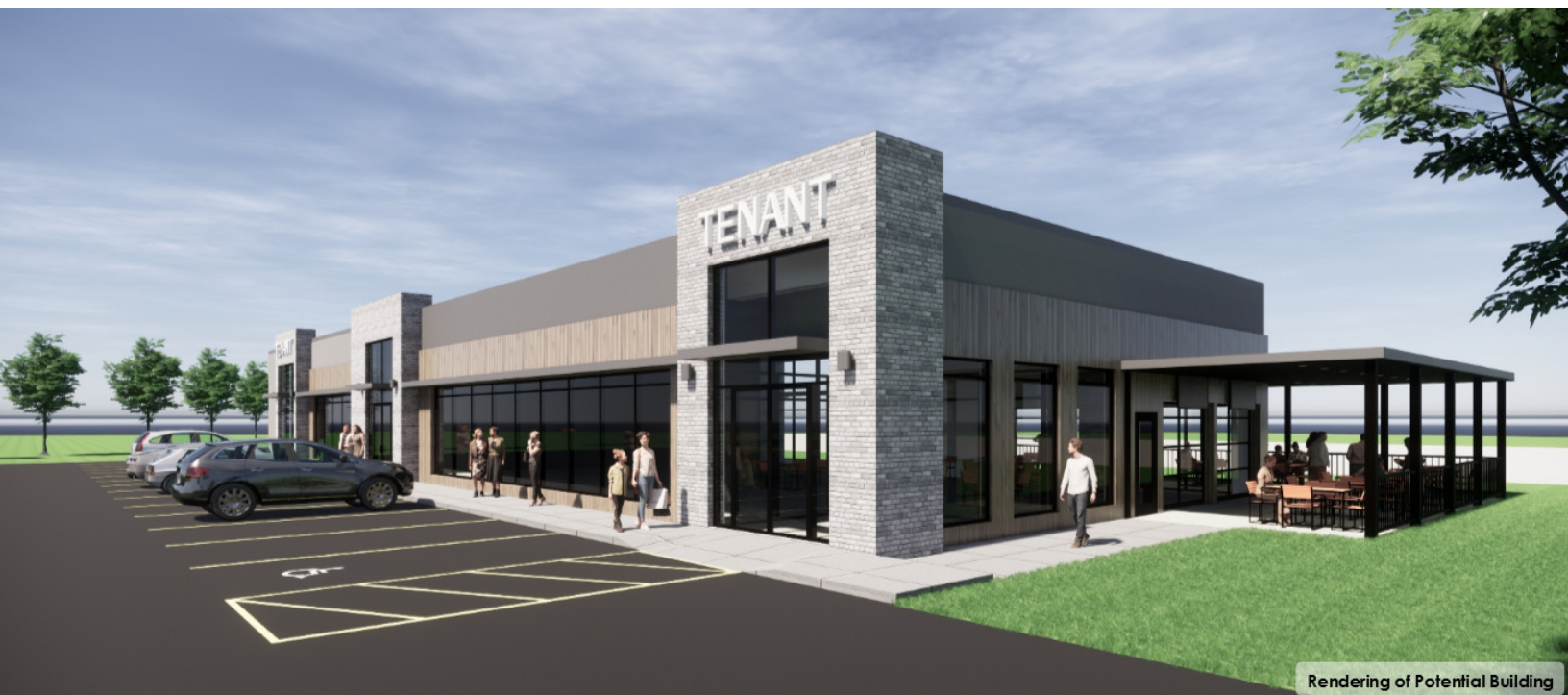
Rendering of Potential Building

FOR LEASE | +/- 1,000 - 10,000 SF (DIVISIBLE) RETAIL/OFFICE SPACE AVAILABLE