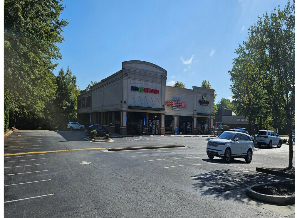
4835 Sugarloaf Pky