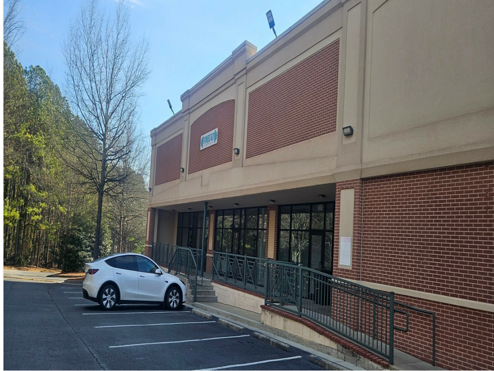
Left Side of Building