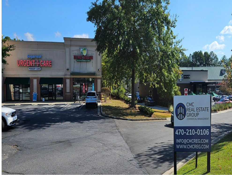
Middle Right Side