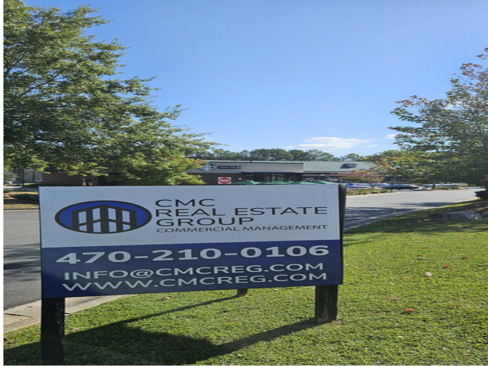
Right Side End Side