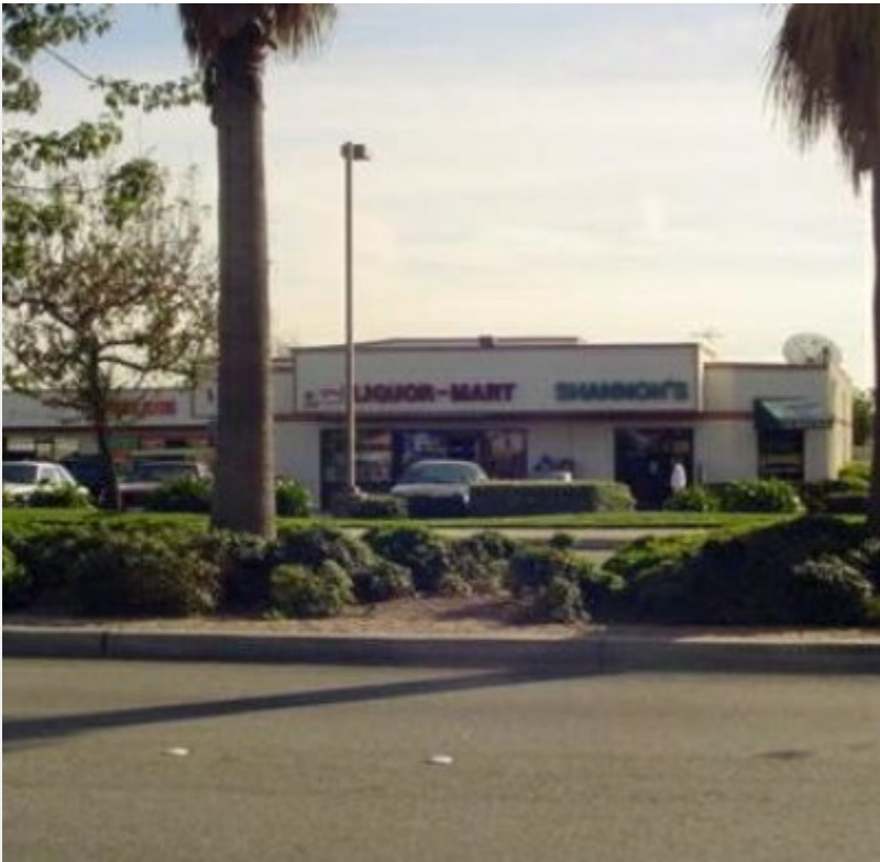
Attractive Community Retail Center