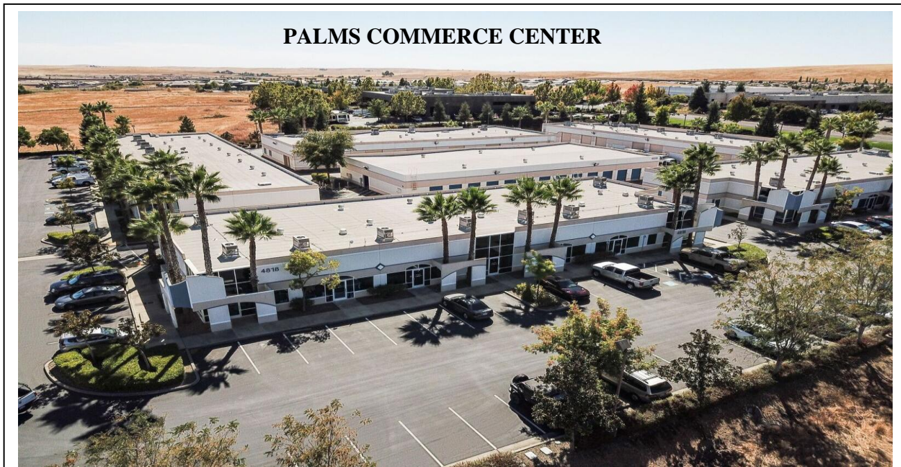
PALMS COMMERCE CENTER