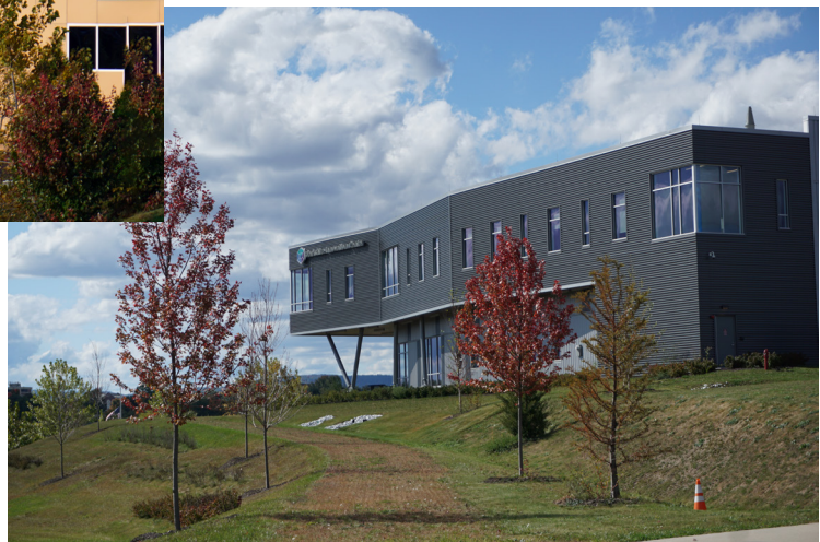
Berkshire Innovation Center