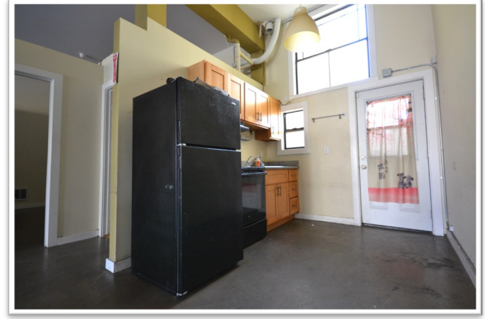
All information herein is offered in good faith and deemed accurate, but not guaranteed.