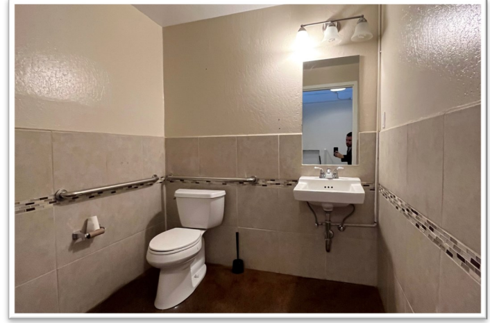
All information herein is offered in good faith and deemed accurate, but not guaranteed.