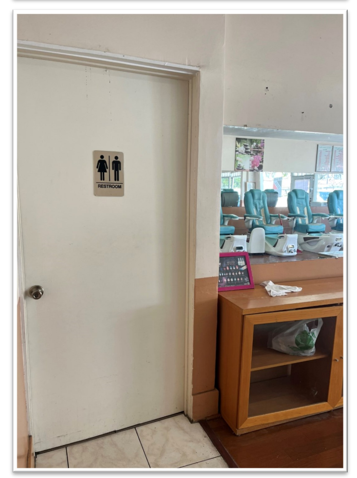
All information herein is offered in good faith and deemed accurate, but not guaranteed.