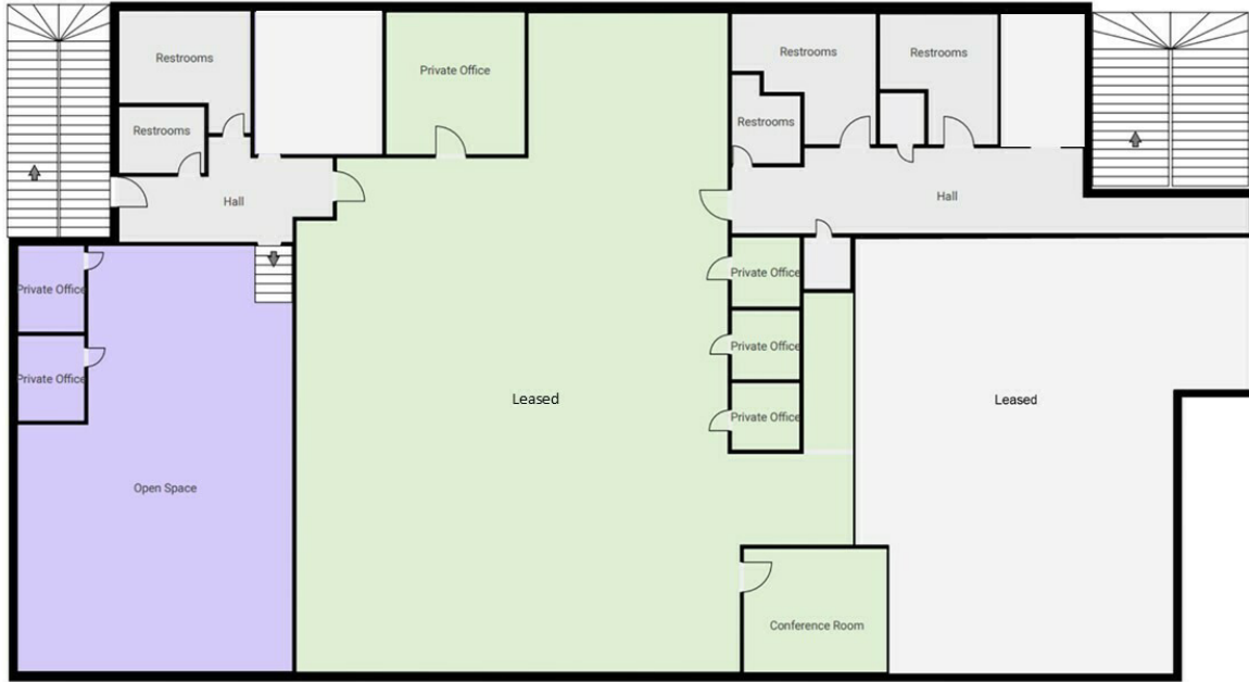
Suite 205 (Purple) Floor Plan