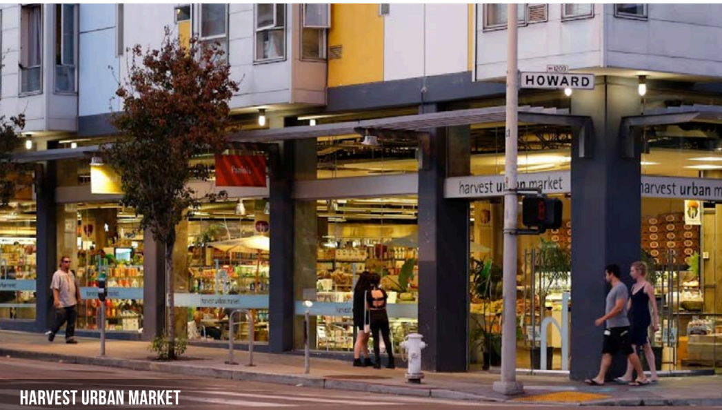
HARVEST URBAN MARKET