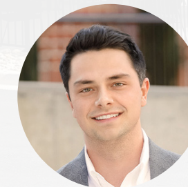
Robert Satcher, Jr.