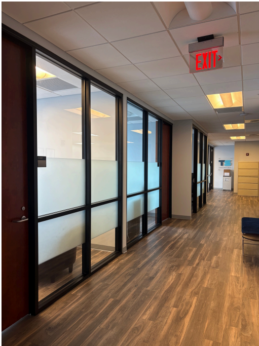
Private Offices (9)