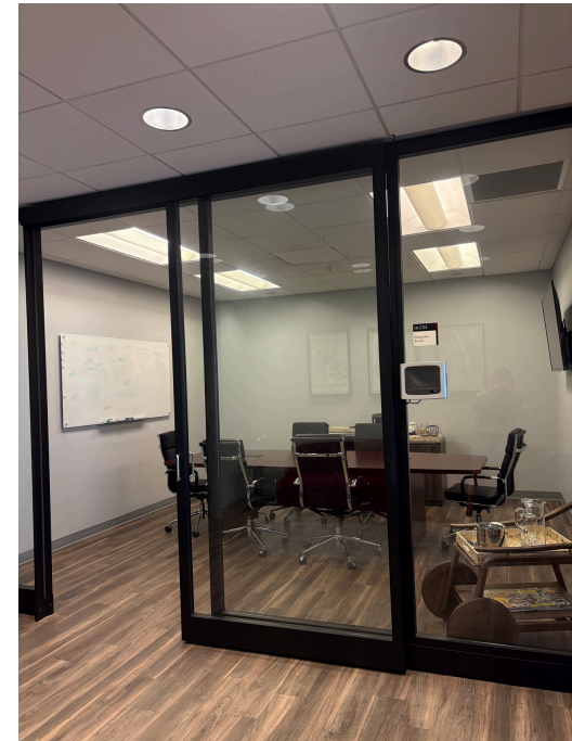
Private Conference Room