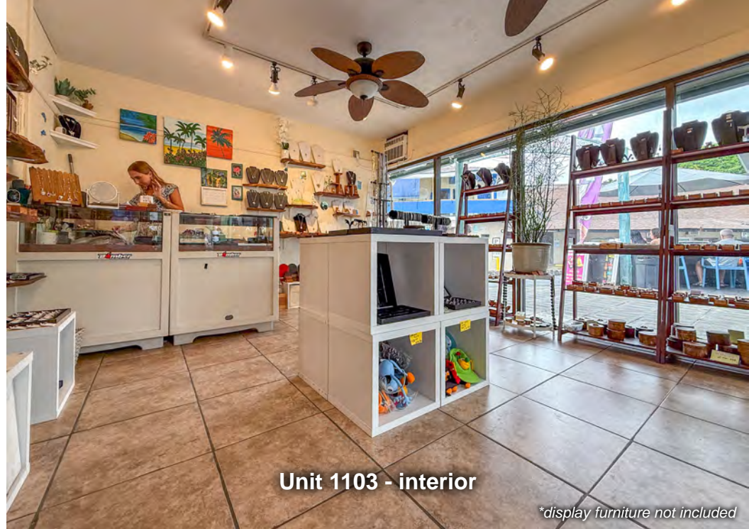
Unit 1103 - interior