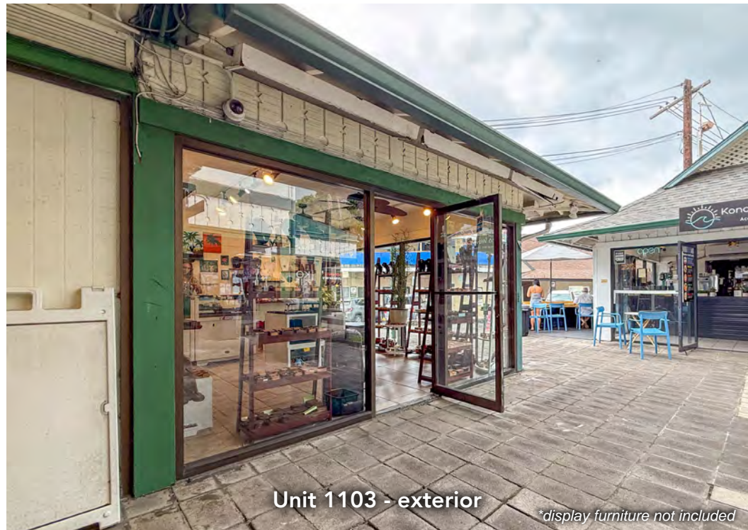
Unit 1103 - exterior