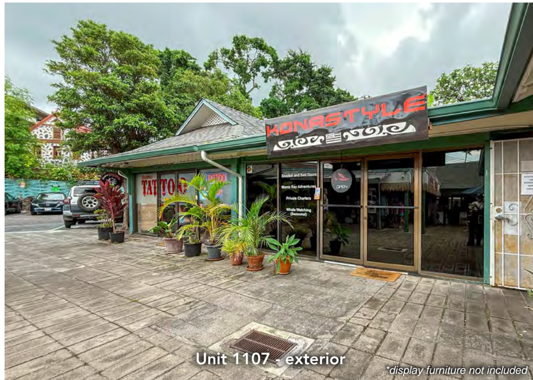
Unit 1107 - exterior