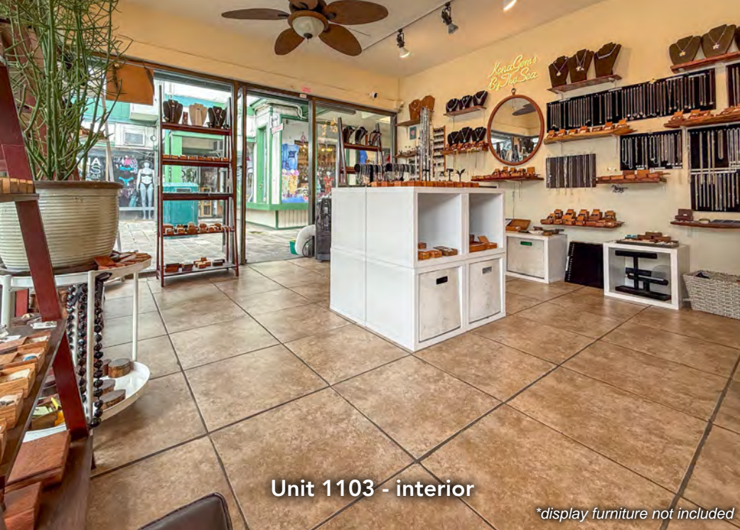
Unit 1103 - interior