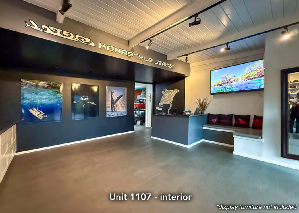
Unit 1107 - interior