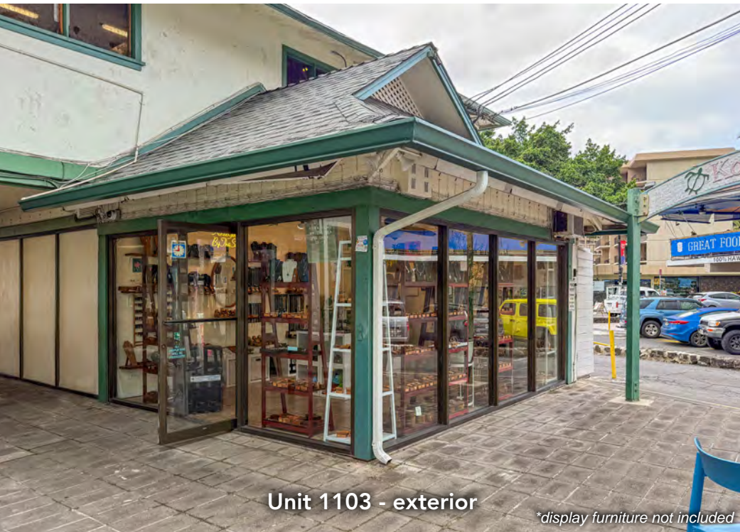
Unit 1103 - exterior