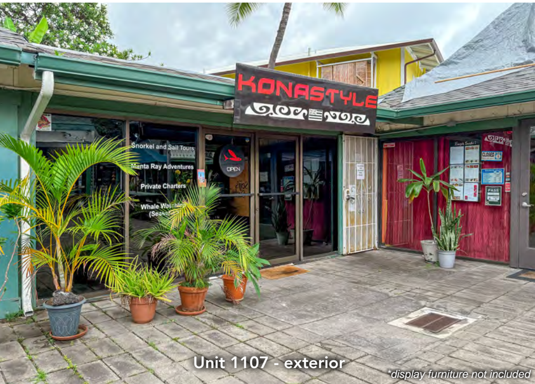
Unit 1107 - exterior