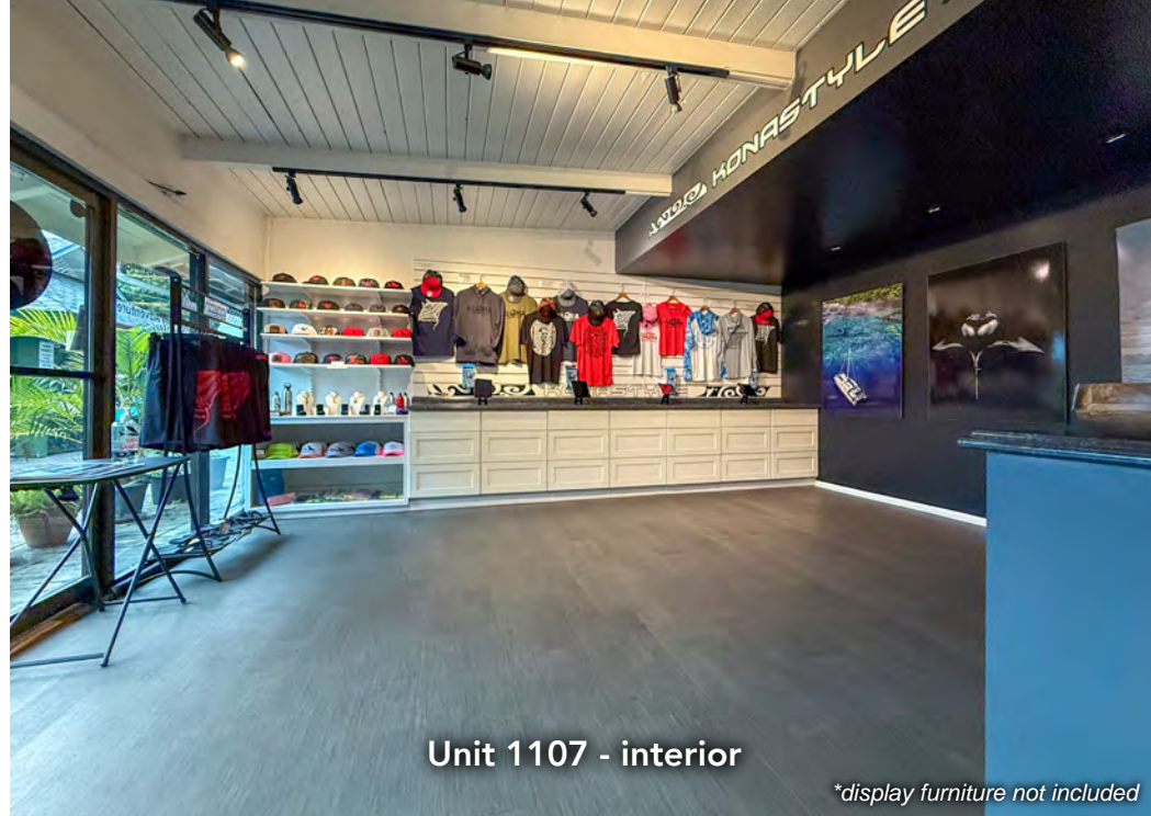
Unit 1107 - interior