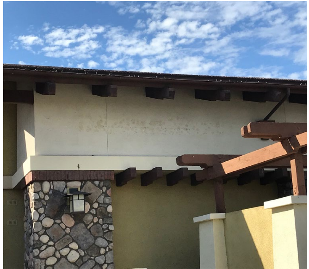
REAR SIGNAGE FACING PARKING LOT