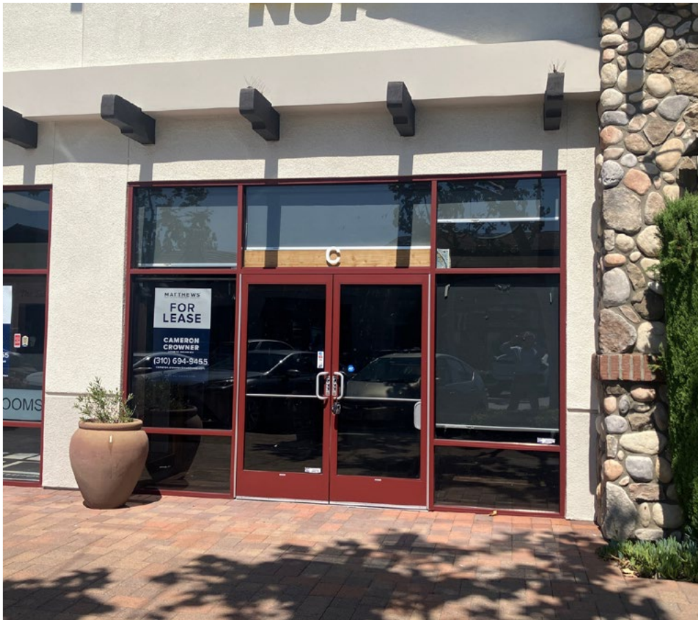
STOREFRONT WITH DOUBLE DOOR ENTRY