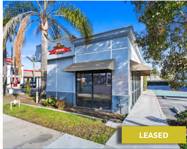
2725 W ORANGETHORPE AVE