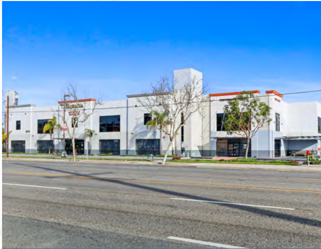
2655 W ORANGETHORPE AVE